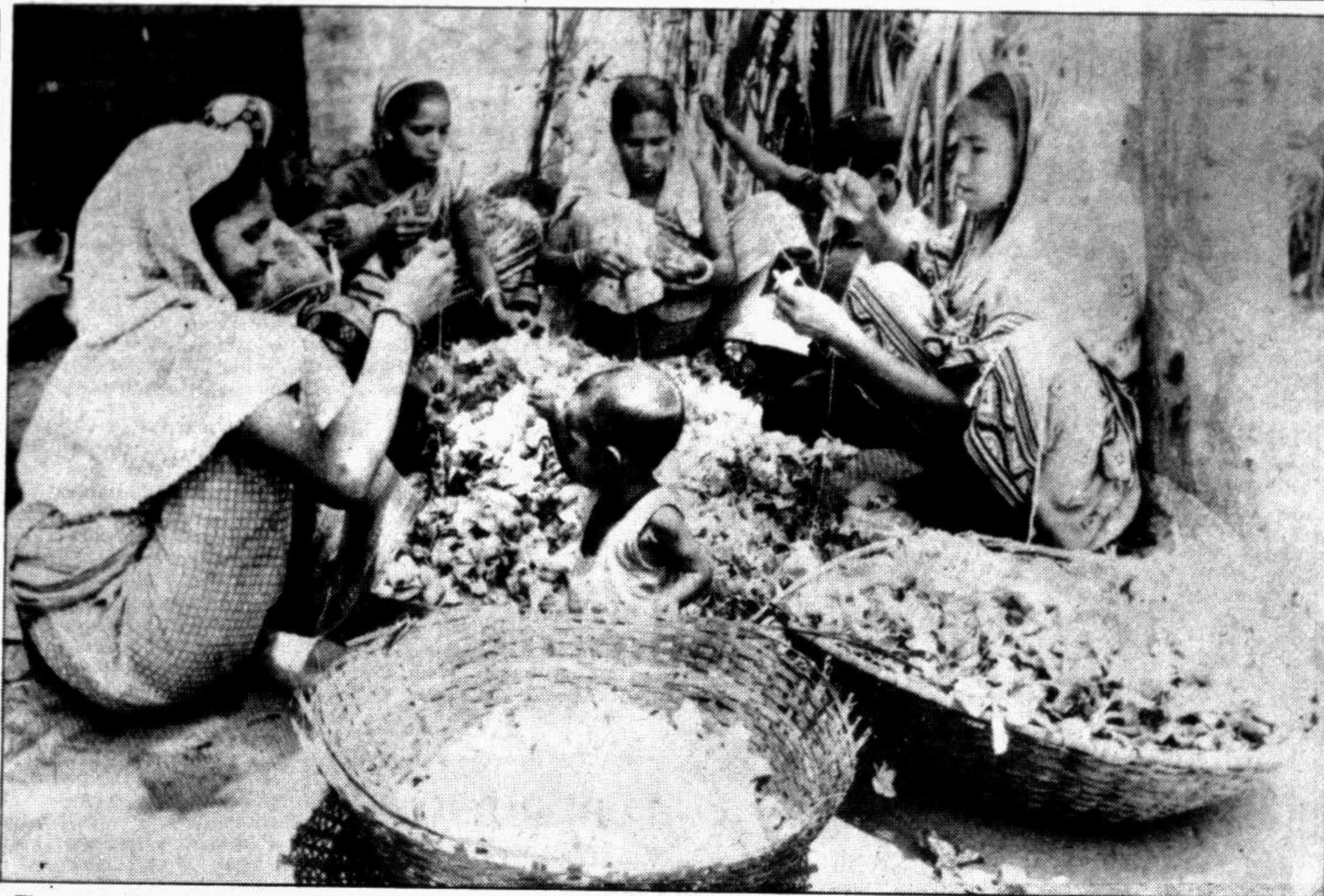
Flower business has gained popularity in some district towns too. Photo shows women are busy making garlands under a tree at Rajshahi.

According to sources, a total of 12,342 tubewells including 482 Tara deep set were installed in the district. Similar number of tubewells are also installed in private sector most of which have already gone out of order.