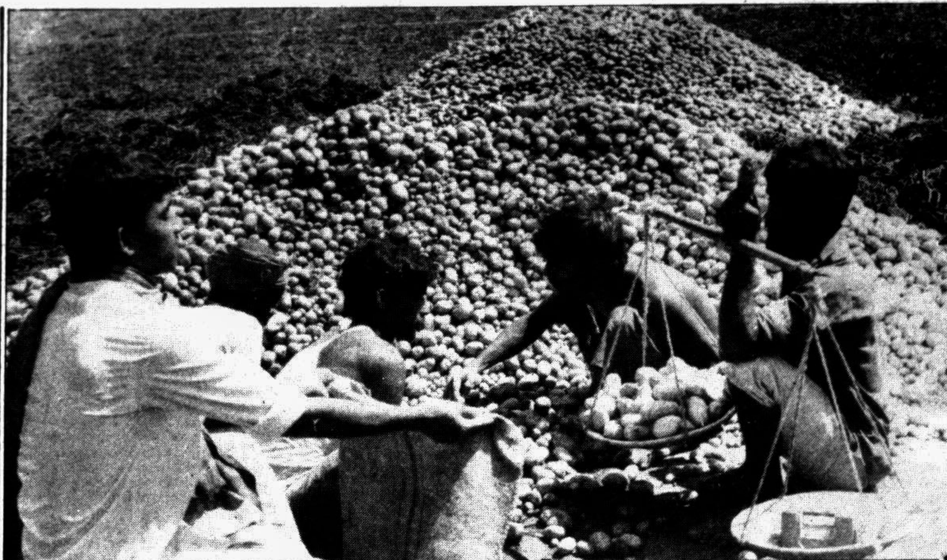
Bumper potato production has been reported this year. Due to meagre storage facility this farmer is selling his produce at throw away price in Chandpur.

From Our Correspondent CHAPAI NAWABGANJ, Apr 22: Twelve persons were killed and some 96 injured in the armed attack of Indian milkmen (ghost) in some frontier villages of Chapai Nawabganj district during the last 17 years since 1975, says a Press release of BDR 31 battalion. The Press release said that the Indian milkmen had been continuing disturbance since 1975 in the villages of Shialmara, Balladighi, Kamalpur, Pirozpur, Daulatbari, Chalkpara, under Shibganj upazila. In the early days the rowdism was confined in stealing and petty robbery but later it turned into armed attack in broad daylight. They enter into the Bangladeshi territory with cattle and graze them in crop fields. When the Bangladeshis protest it they fall on them with bthai arms. So far such kinds of armed attack killed 12 Bangladeshis nationals and wounded 96, many of them seriously. Many of the injured have become crippled. They carried away 980 cattlehead and 1230 goats from the Bangladeshi land.