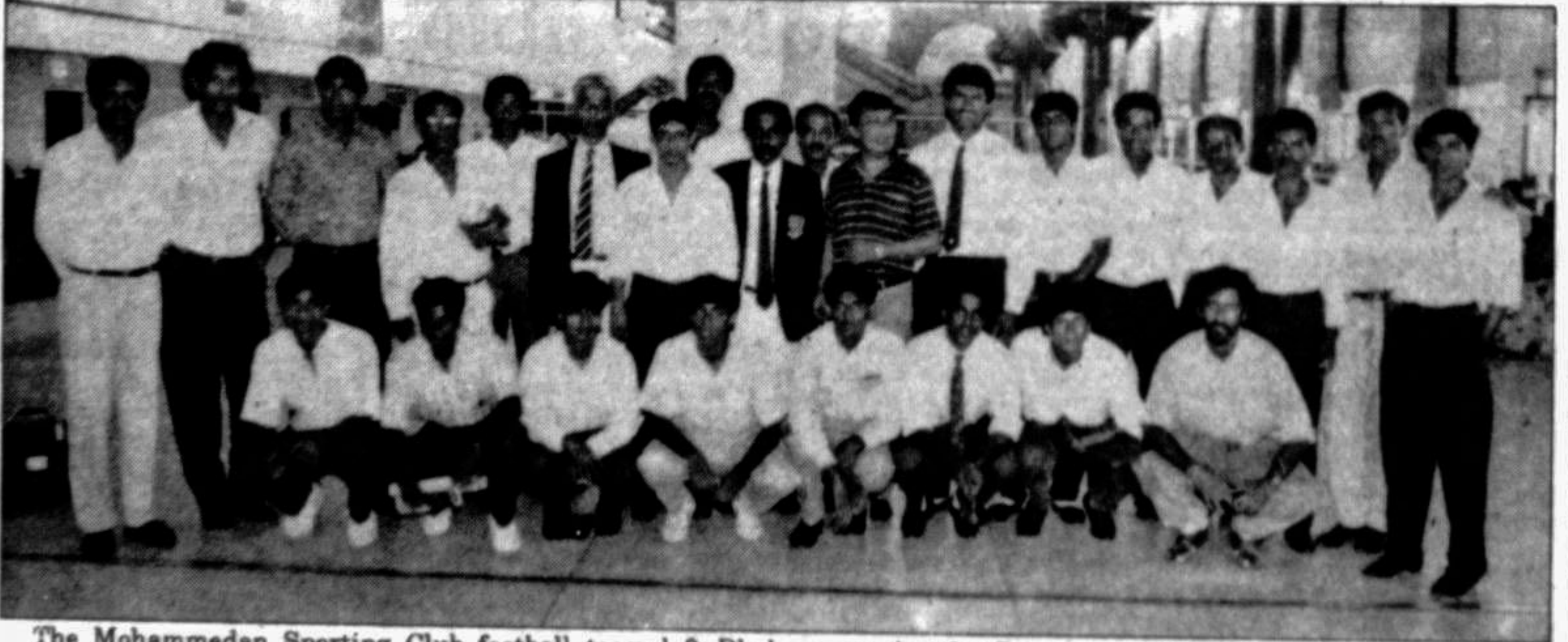
The Mohammedan Sporting Club football team left Dhaka yesterday for Riyadh to take part in the Asian Club championship two-leg matches against the Saudi champions Al-Helal Club.

stretching ninth team title in a row could shatter against the combined talents of the Koreans. The south, who lost to China in the 1989 team finals, are bolstered by northerner Li Bun-Hui, who reached the women's singles final two years ago only to lose against China's Qiao Hong. Qiao is back again alongside diminutive Deng Yaping, who won the doubles title at Dortmund as a 16 with Qiao. Deng consolidated her reputation as a world beater when she bagged three golds at the Asian Games at Beijing last year. The 41st championships over two weeks at the Japan Convention Center bring together 58 men's and a record 59 women's teams, with Kuwait taking part.