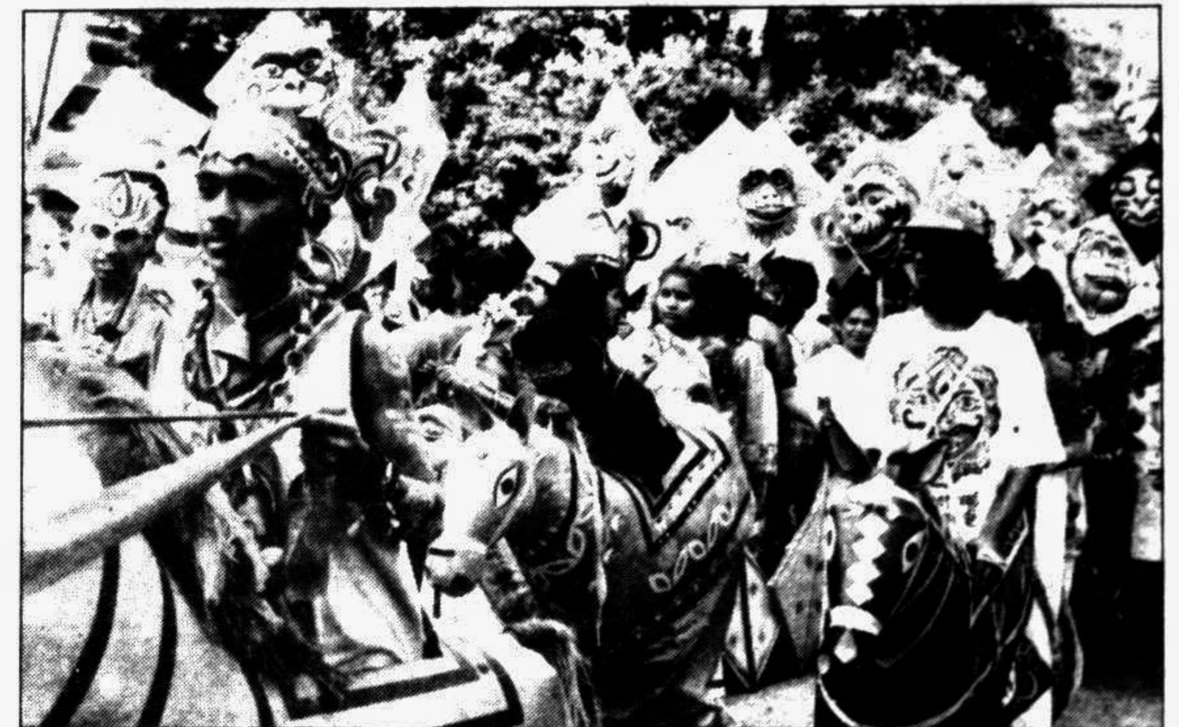
Students of Arts College in city brought out a colourful procession Monday last to welcome the Bengali New Year 1398 B.S.

The day was a closed holiday. Newspapers brought out special supplements while Radio Bangladesh and Bangladesh Television put out special programmes on the significance of the day.