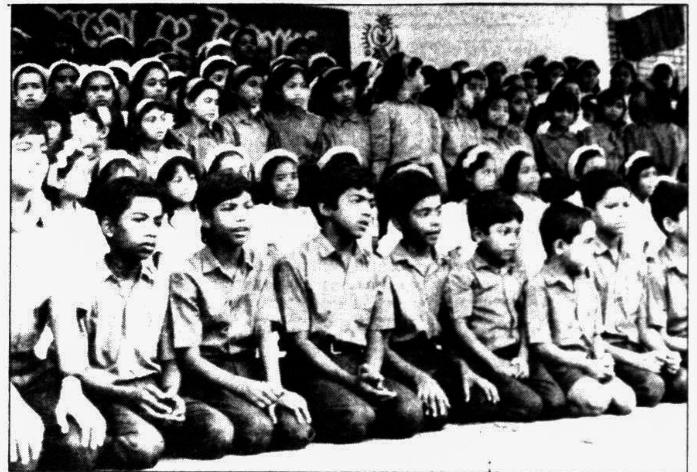
Child artistes at Shishu Academy