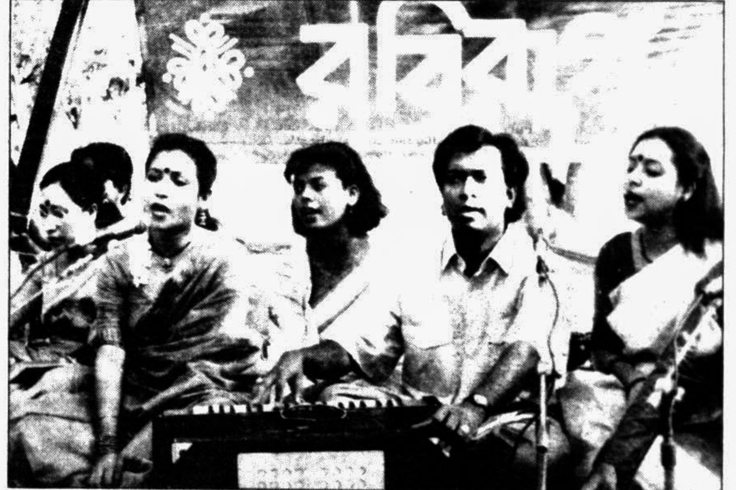
Rabiragh, a cultural organisation, held a musical soiree Monday morning at Ramna Park.