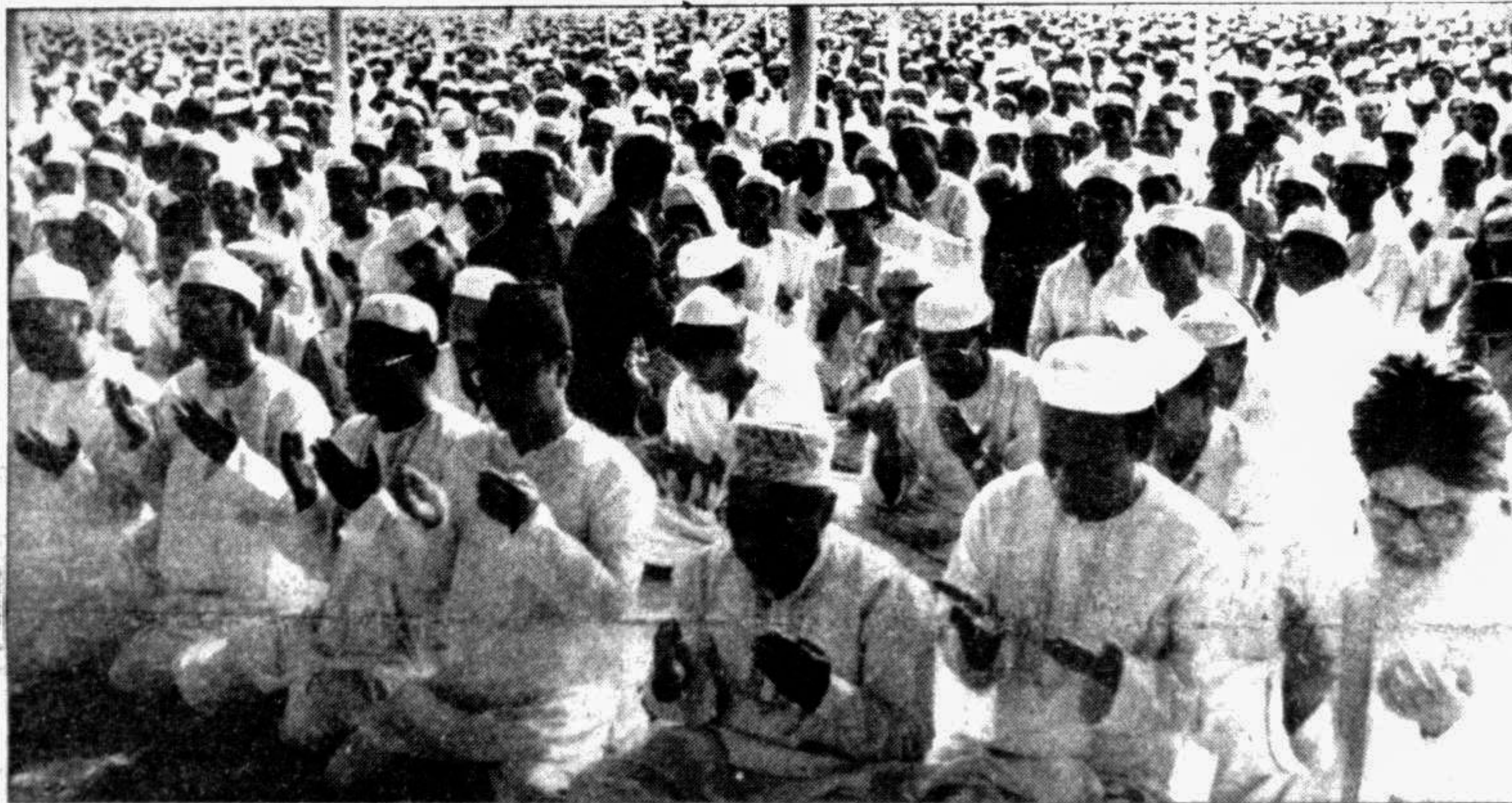
Eid congregation at the National Eidgah in Dhaka Wednesday.

HAMBURG, Apr 19: Matthias Rust, the German youth who in 1987 embarrassed the Soviet military by landing his light plane in Red Square was jailed for two and half years here Friday for attempting to kill a nurse who rejected his sexual advances, reports AFP.