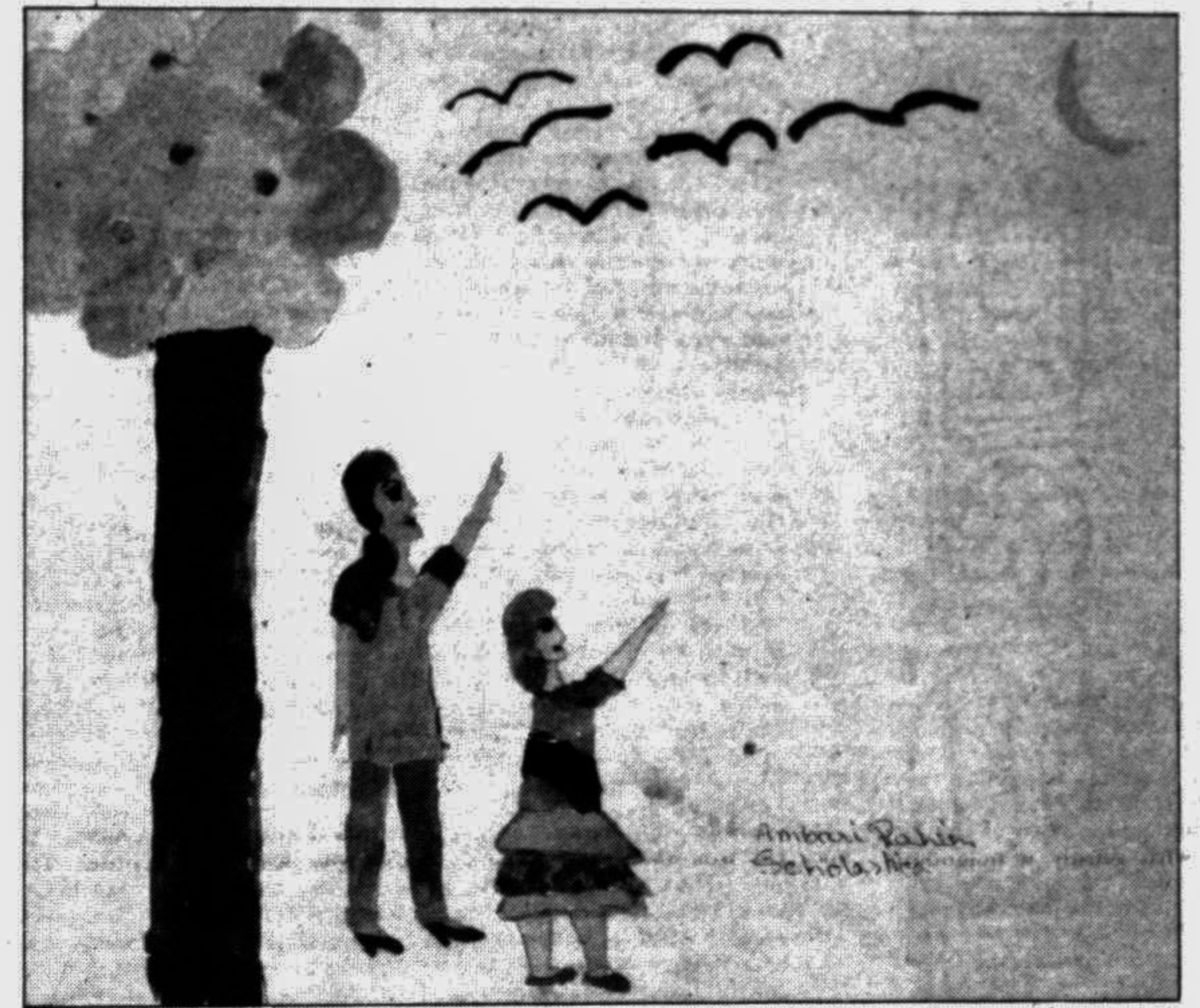
New moon of Eid, by Ambira Rahim, of Scholastica School