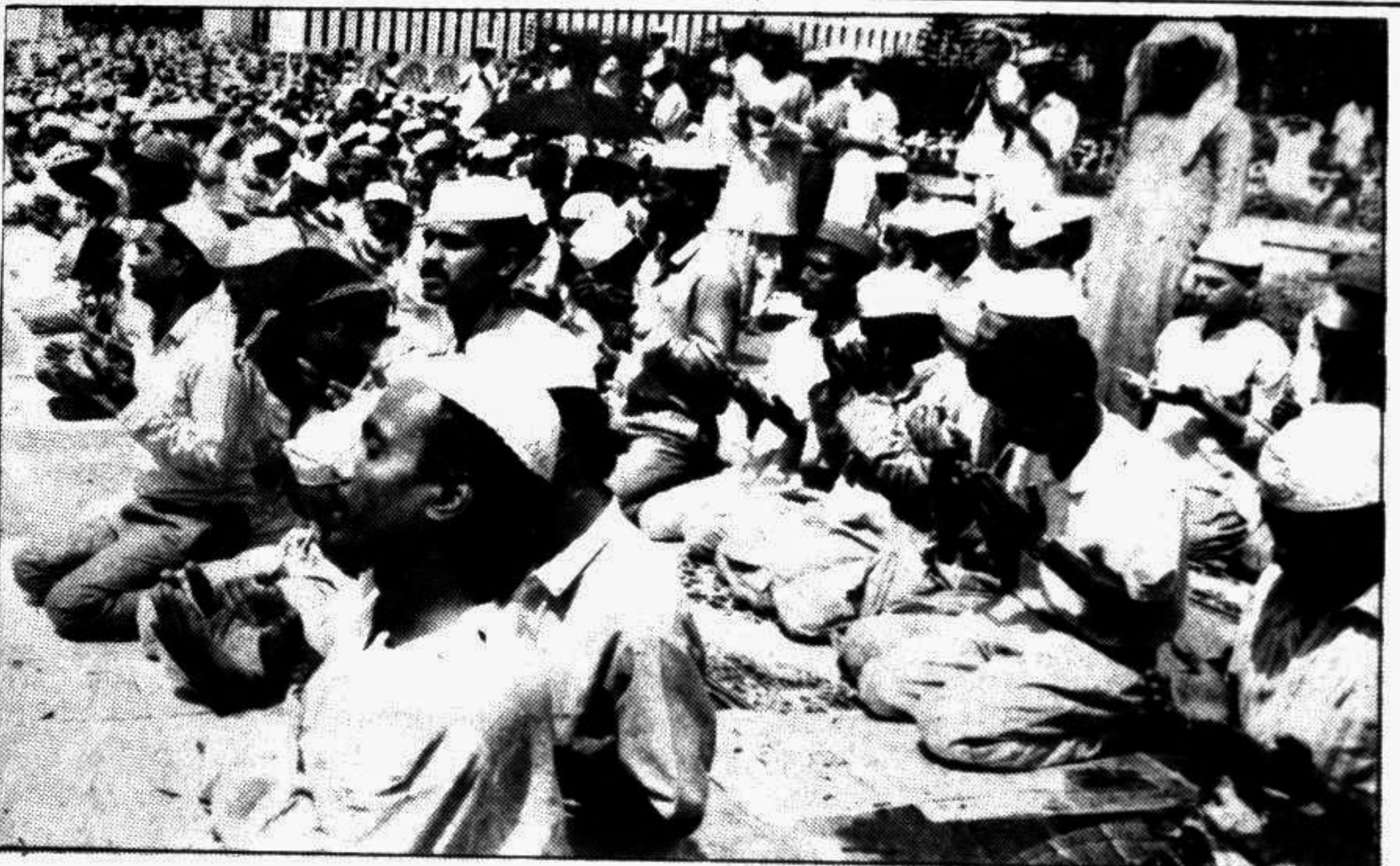
A partial view of huge Jumatul Wida congregation at Baitul Mukarram mosque on Friday.

Principal Staff Officers of the three services, senior military officials and large number of service personnel were also present.