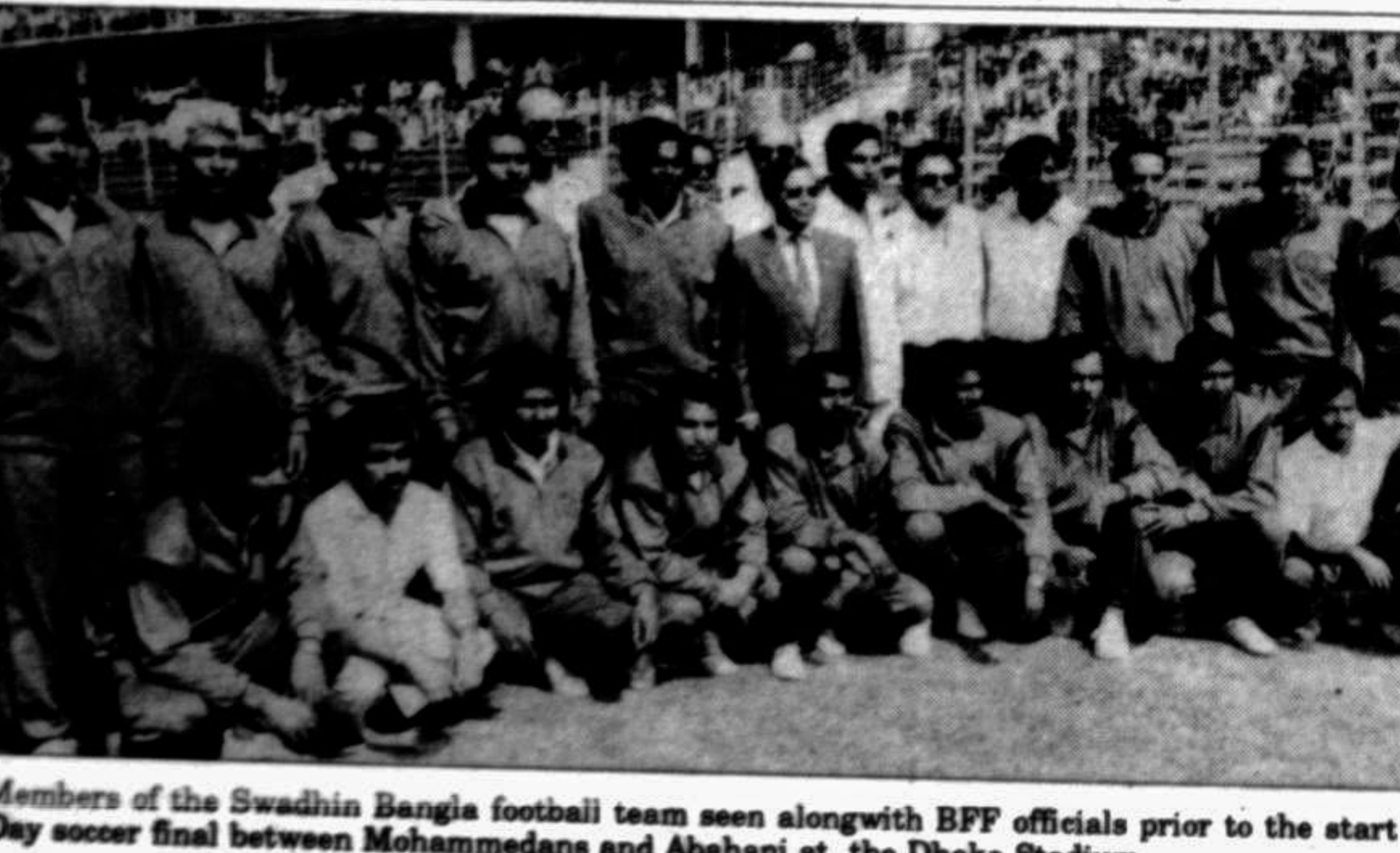
Members of the Swadhin Bangla football team seen alongwith BFF officials prior to the start of Monday's Independence Day soccer final between Mohammedans and Abahani at the Dhaka Stadium.