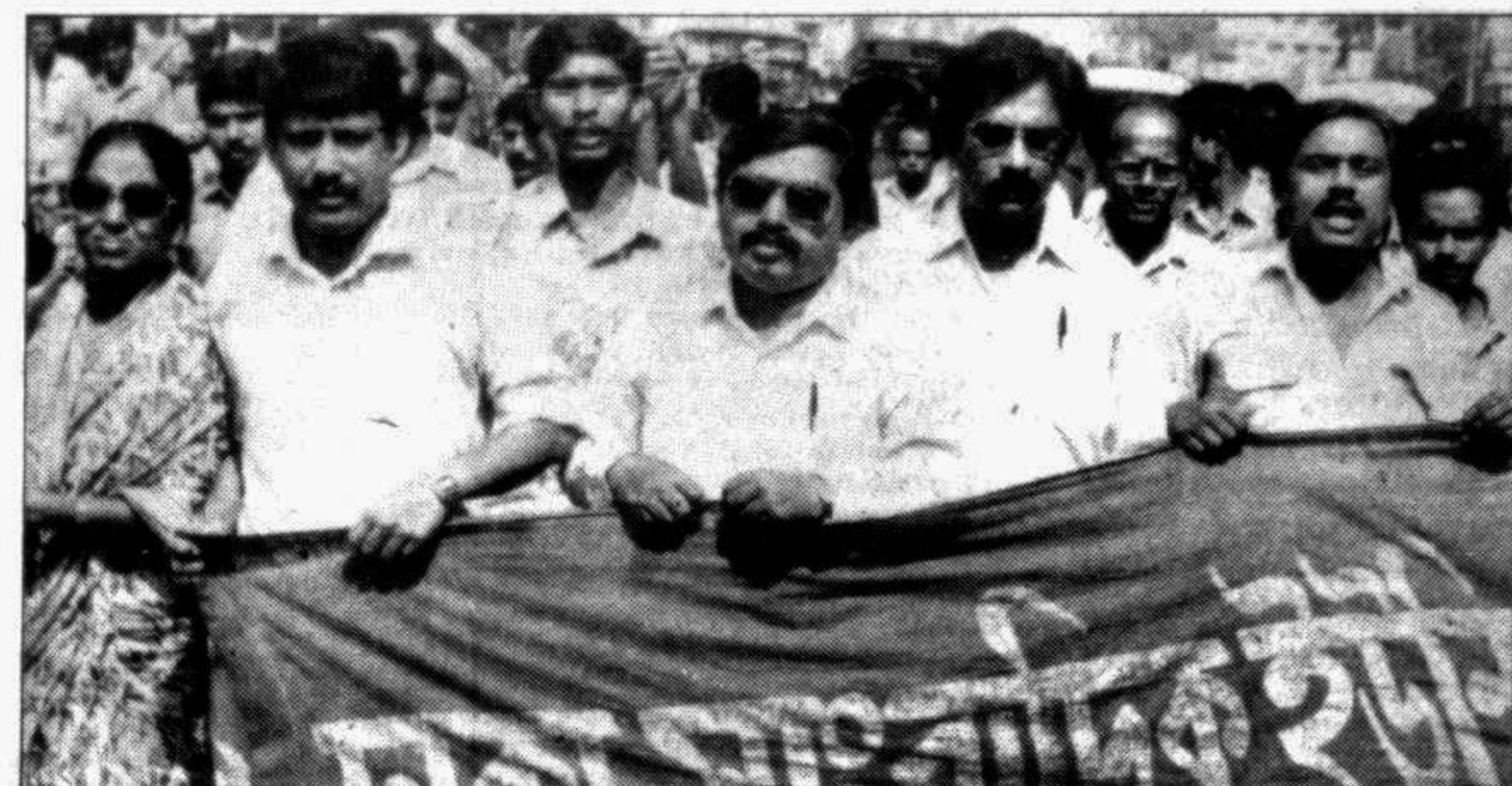
A procession was brought out by Dhaka Union of Journalists (DUJ) on Tuesday to press home its demands for reinstatement of journalists of the Dainik Desh and the Bangladesh Observer and payment all dues of journalists of the Dainik Dinkal and the Nava Avijan.