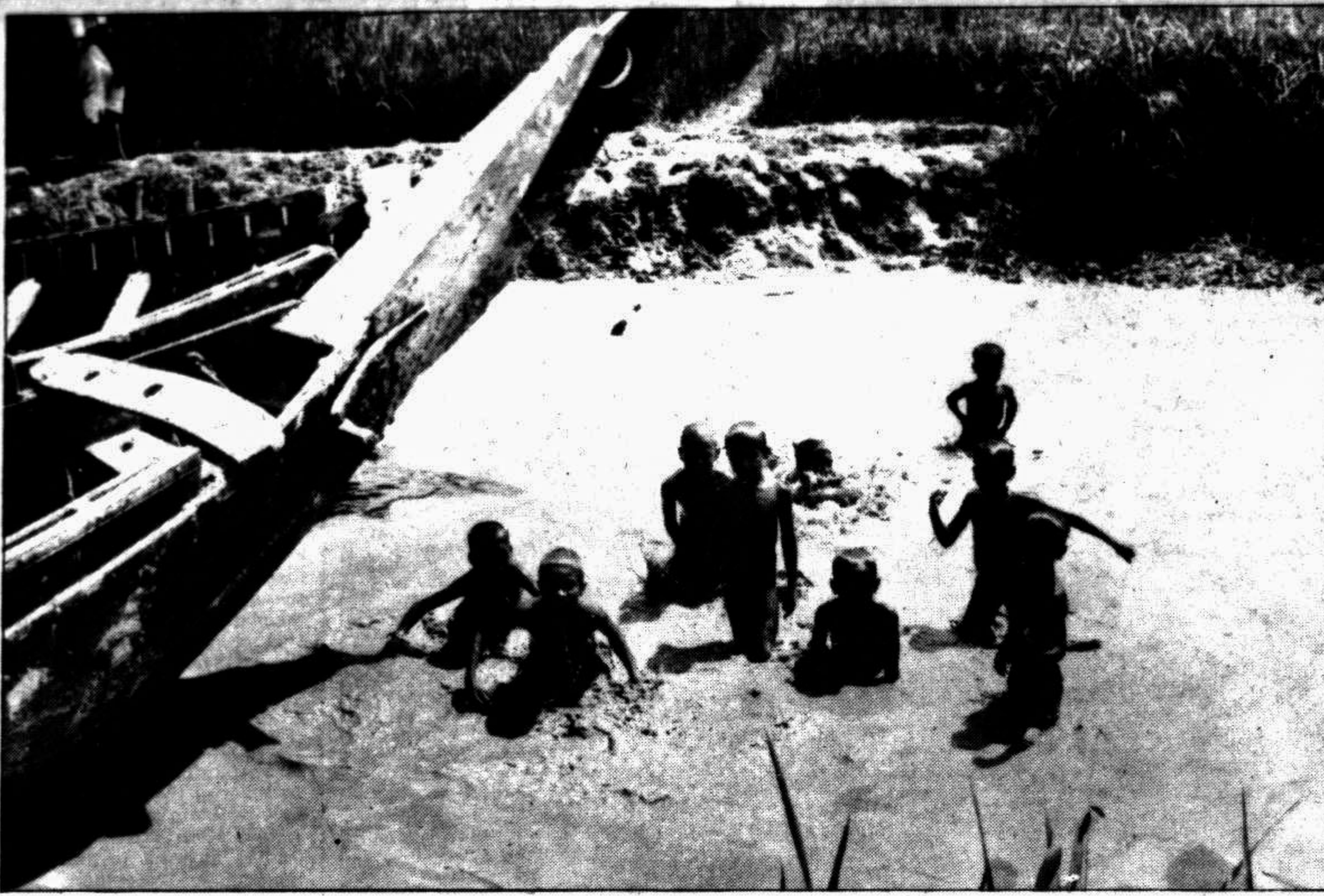
Children playing in a shallow canal to get rid of heat wave at a village in Narsingdi district.

Police after investigation issued charge sheet against the accused Rishikesh.