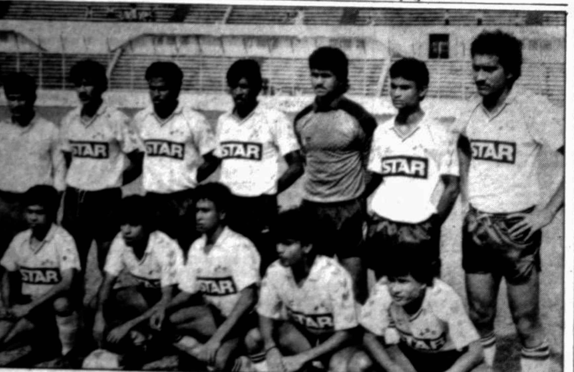
1991 Independence Day soccer champions Mohammedan Sporting Club pictured before the start of yesterday's final at Dhaka Stadium.