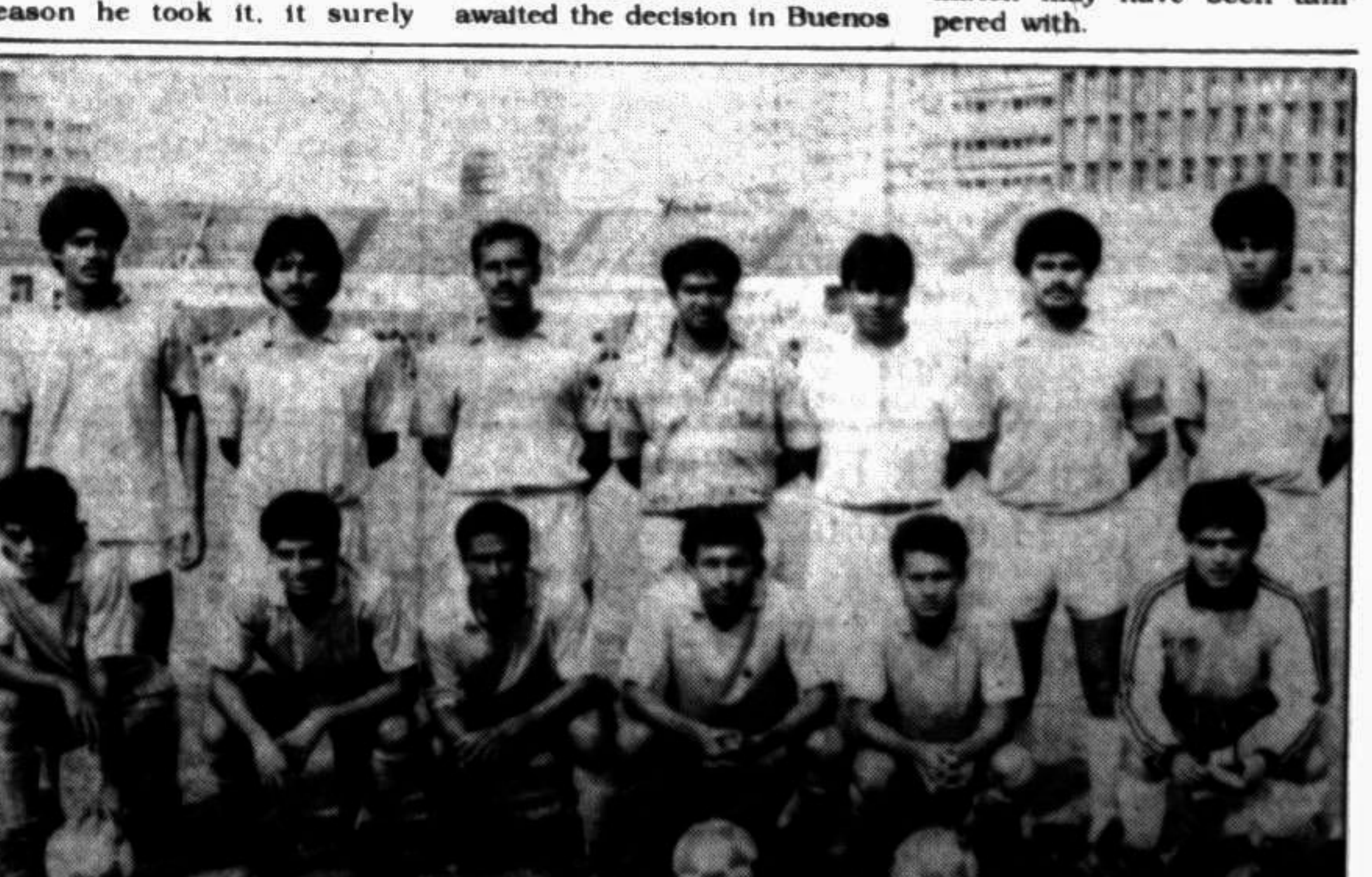
Last year's champions Abahani Krira Chakra.