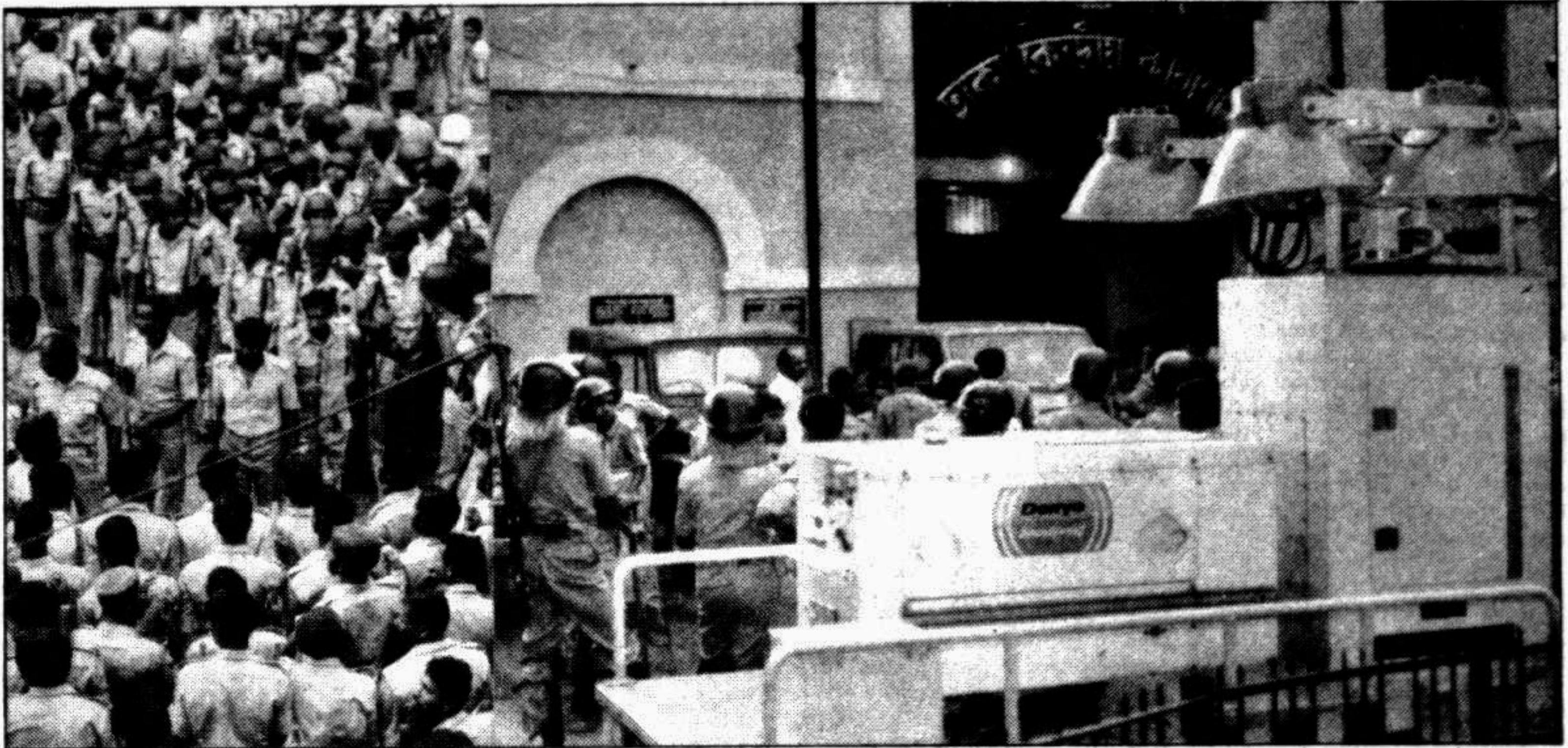
Armed contingents of BDR, police and jail guards waiting at the Dhaka Central Jail gate for a 'green signal' to begin operation as prisoners revolted on Monday. 6000-watt lights mounted on two trucks of the Fire Service were used for the night crackdown.