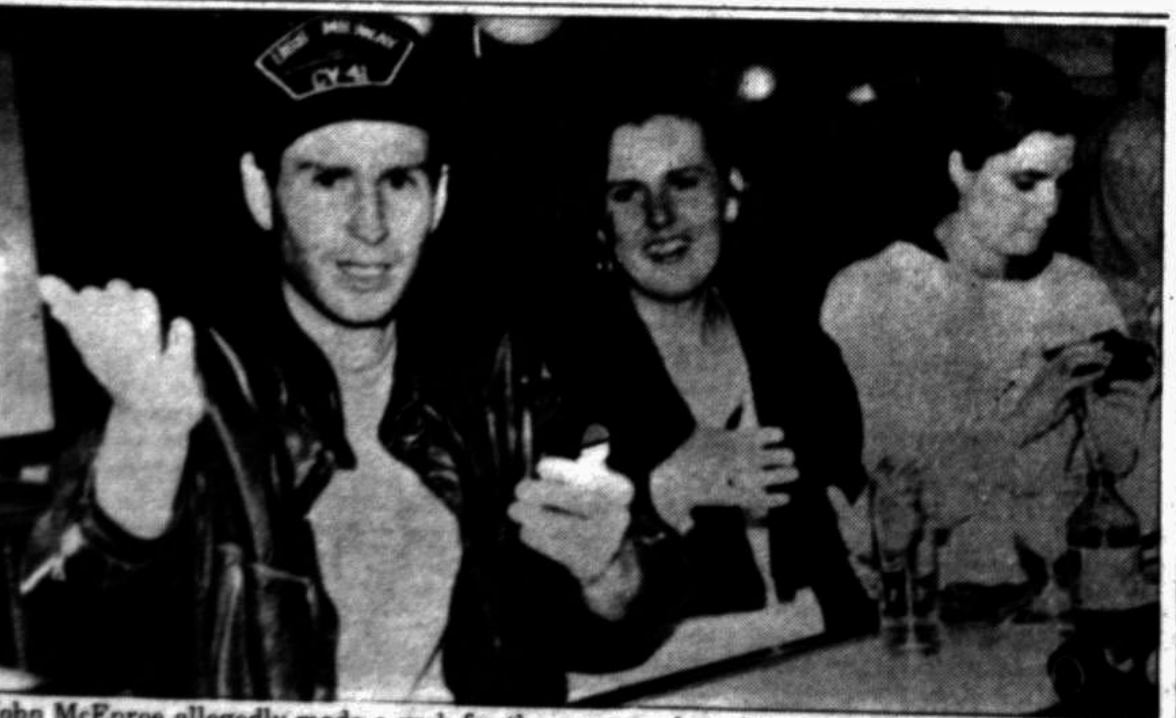
John McEnroe allegedly made a grab for the camera when this picture was taken in a Hong Kong pub where he was drinking with a group of US servicewomen April 5.