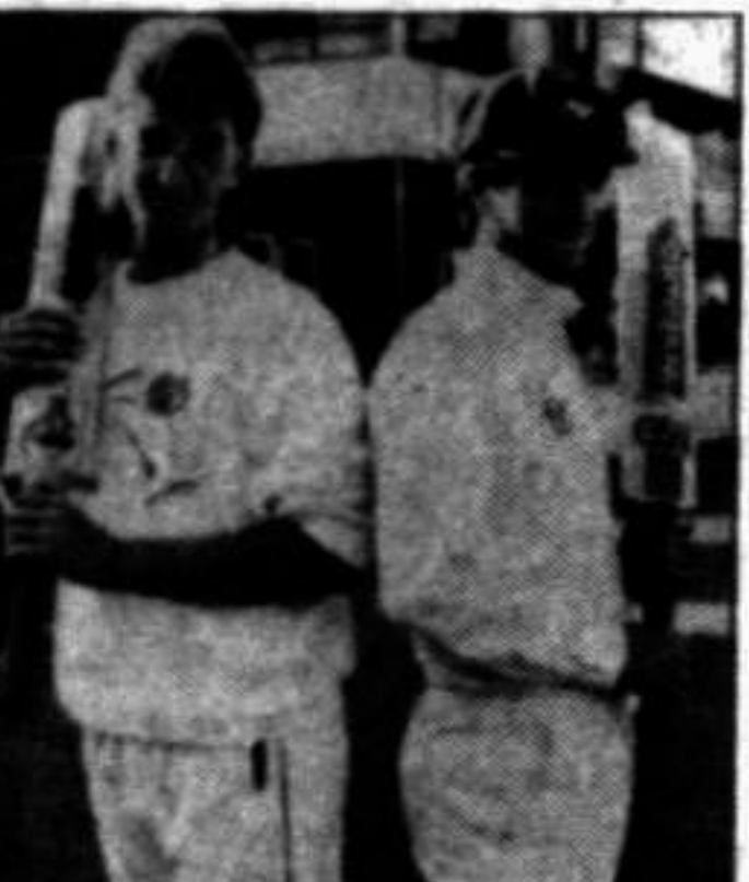
Mark (L) and Steve

PORT-OF-SPAIN (Trinidad), Apr 6: Steve and Mark Waugh became the first pair of twins to play together in 114 years of test cricket when they were named in the Australian side to meet the West Indies in the third Test on Friday, reports IBC.