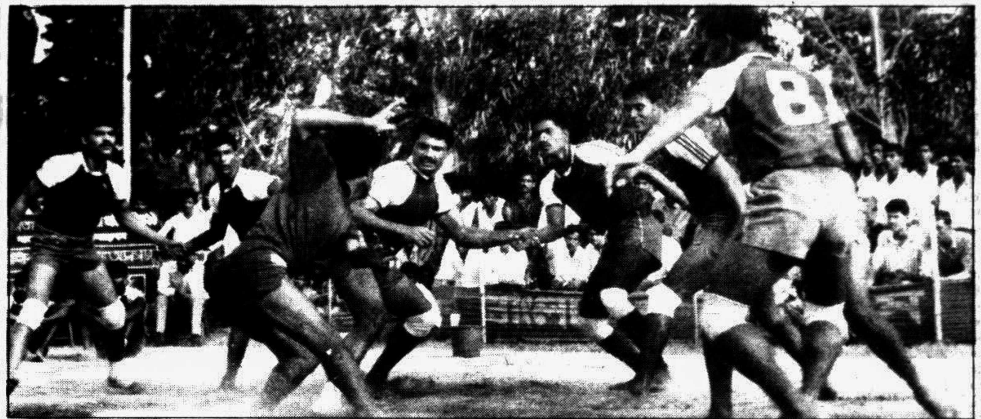
Action from the Independence Day kabaddi final at the Outer Stadium yesterday. BDR beat Bangladesh Ansars to lift the title.