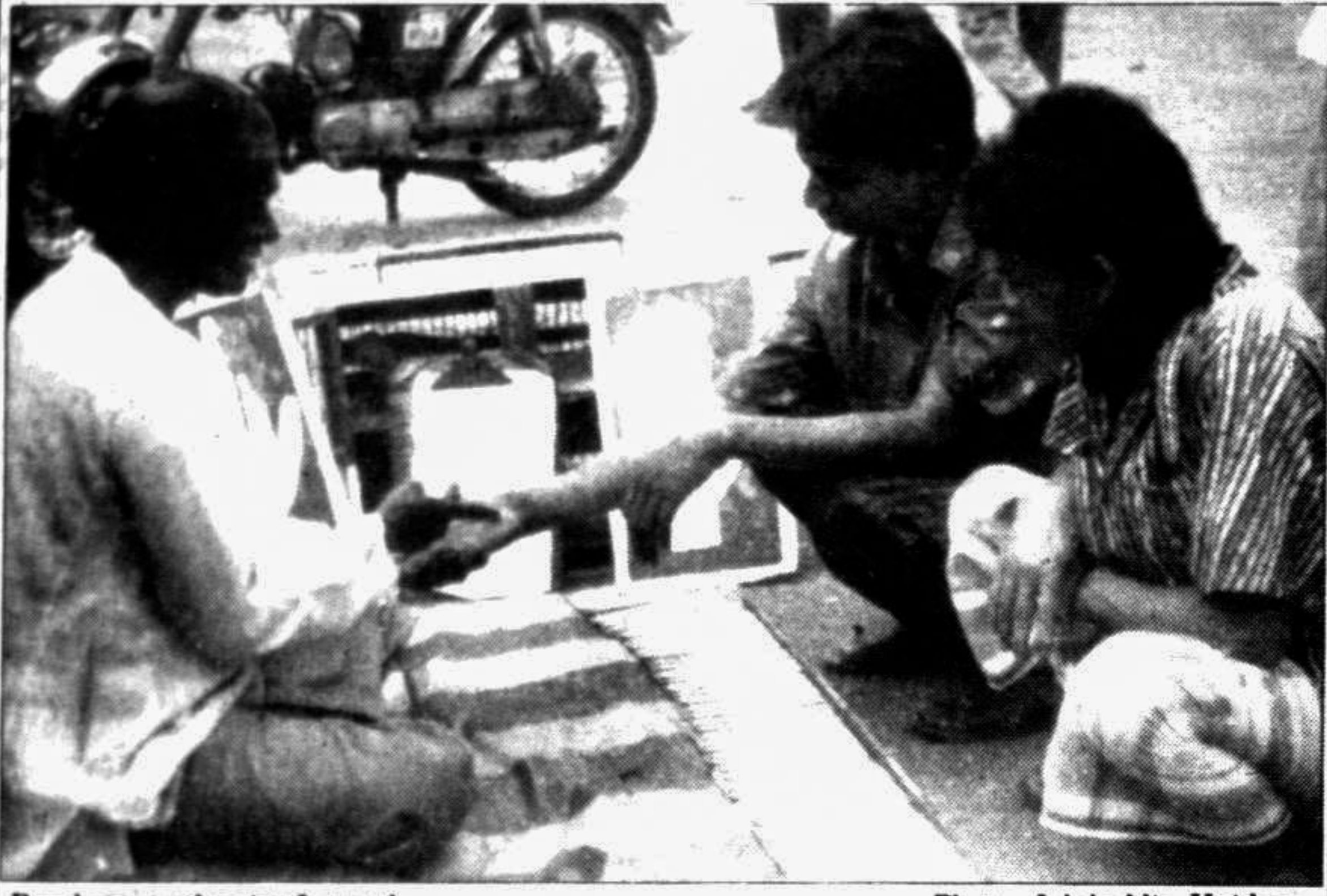
Prophecy on the city footpath.