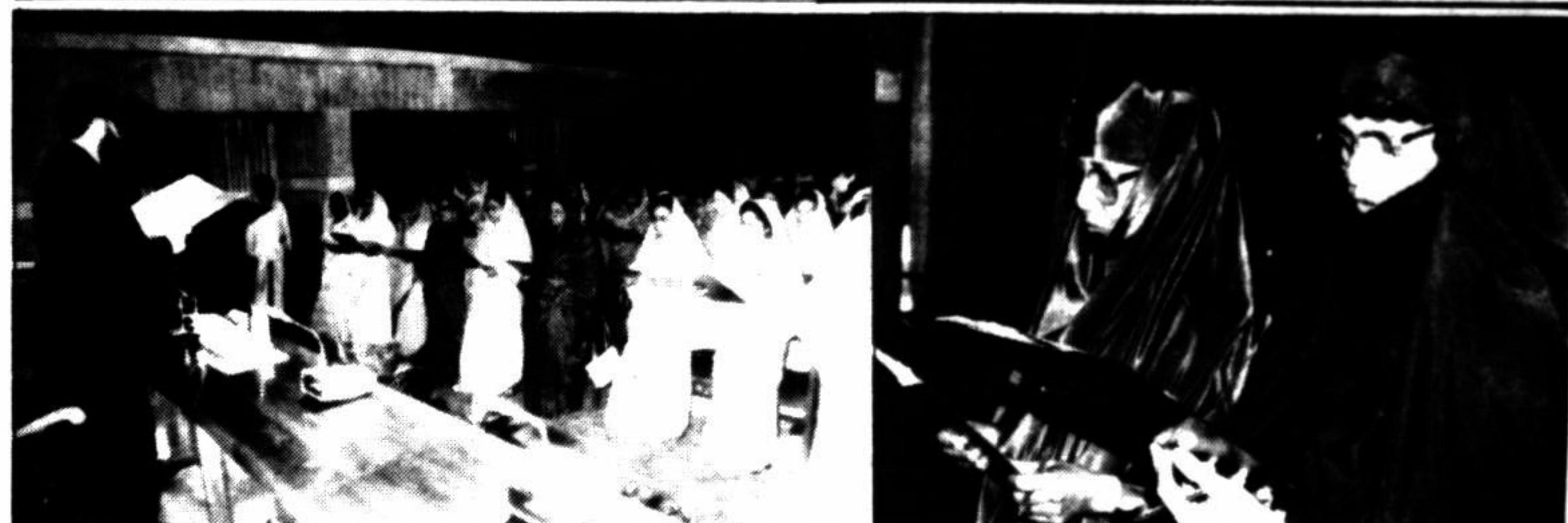
Chief Election Commissioner Justice Rouf administering oath to women MPs at Sangsad Bhaban on Monday.

NEW DELHI, Apr 1: Indian environmentalists said Monday they were trying to determine whether a huge patch of black oily snow in the Himalayan mountains was caused by the burning oil fires in Kuwait. The patch, about one square kilometer (247 acres), was found by skiers in an inaccessible area near Gurd, 60 kilometers (37 miles) north of Srinagar in the Kashmir province last week, reports AP.