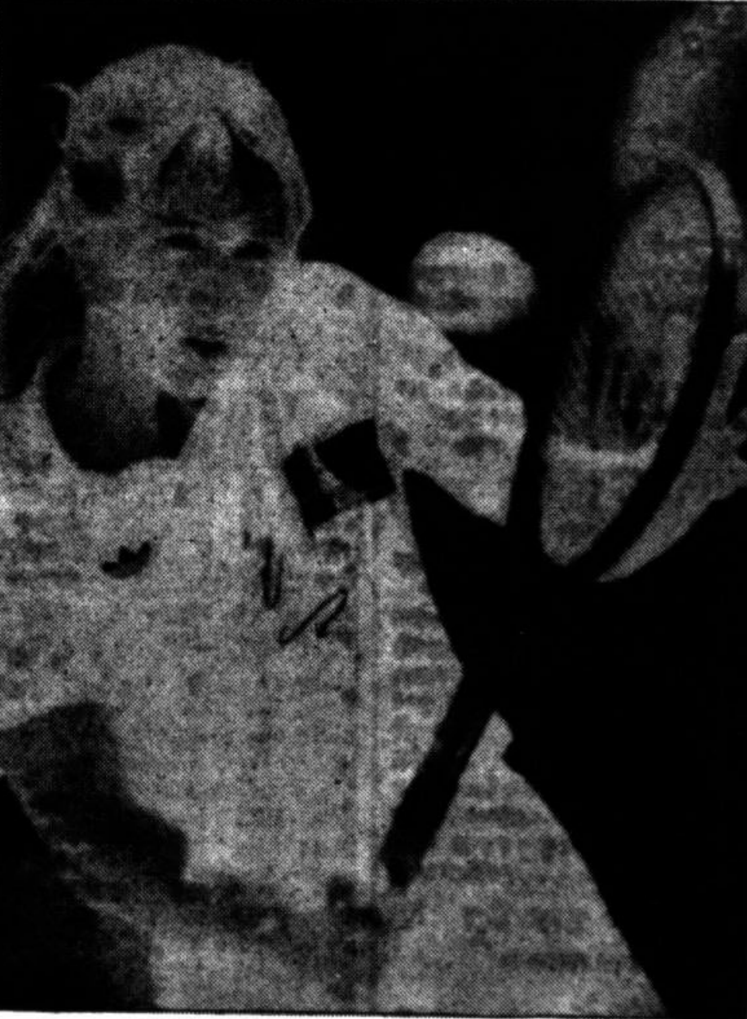
STEFFI GRAF... a gratifying victory

game, but a Graf volley, a Seles shot into the net and a Graf cross-court winner ended the match.