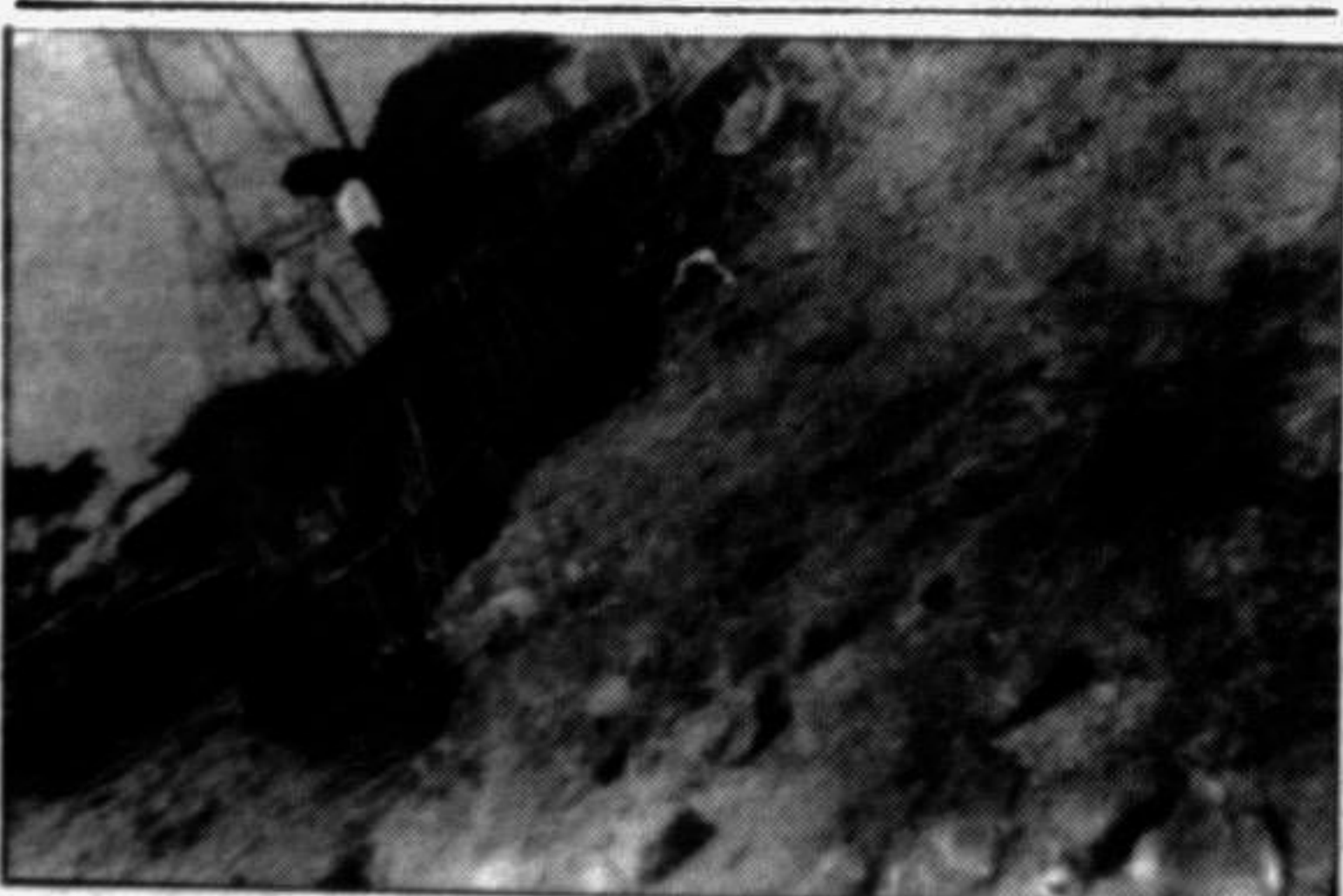
KISHOREGANJ: The 132 kv overhead electric tower at Katpatty of Bhaibrab town threatened with the fury of the mighty river Meghna.