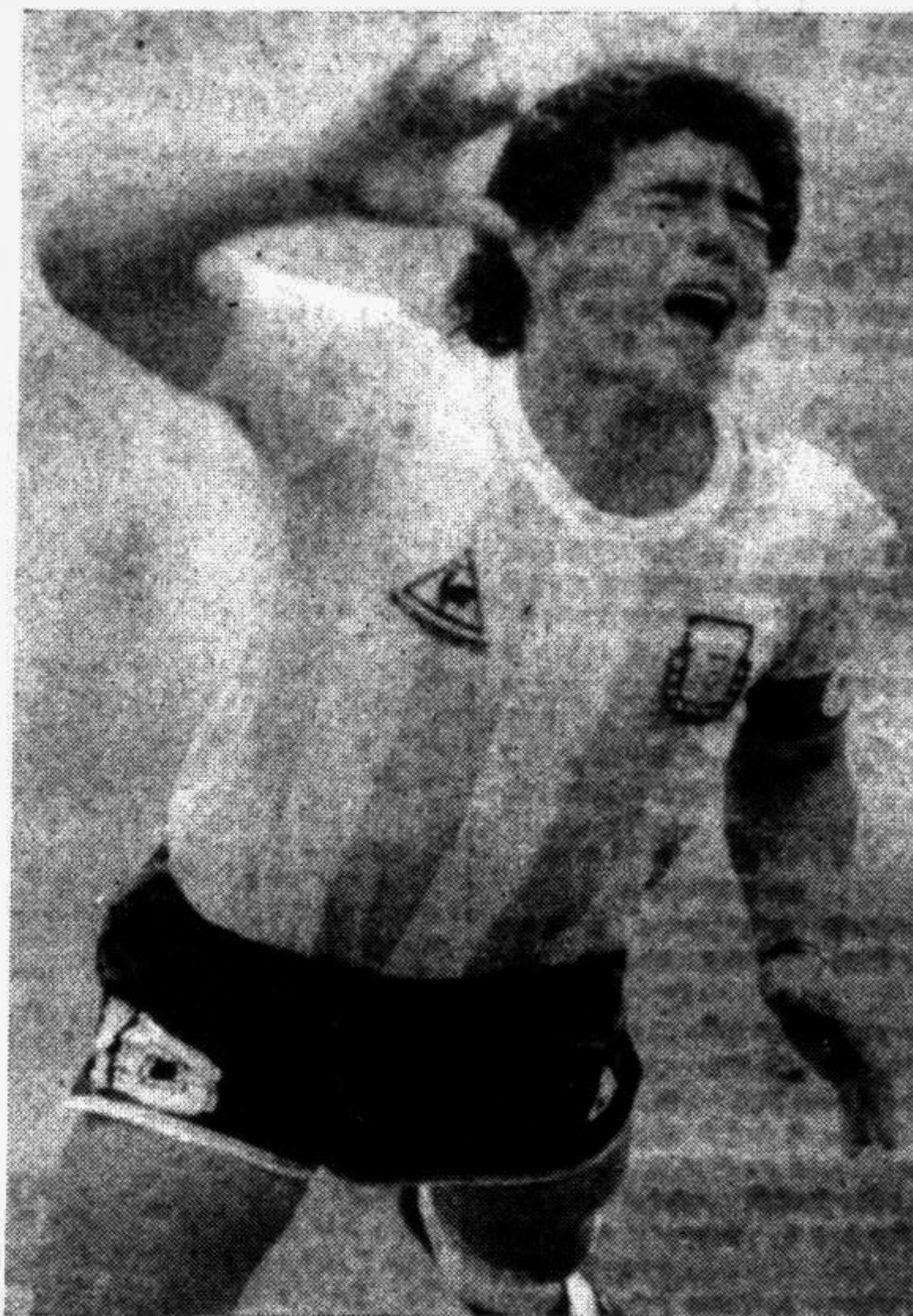
disciplinary commission which is expected to meet next week to deal with it.

The Italian Football Federation (FIGC) is referring the case to the football league's