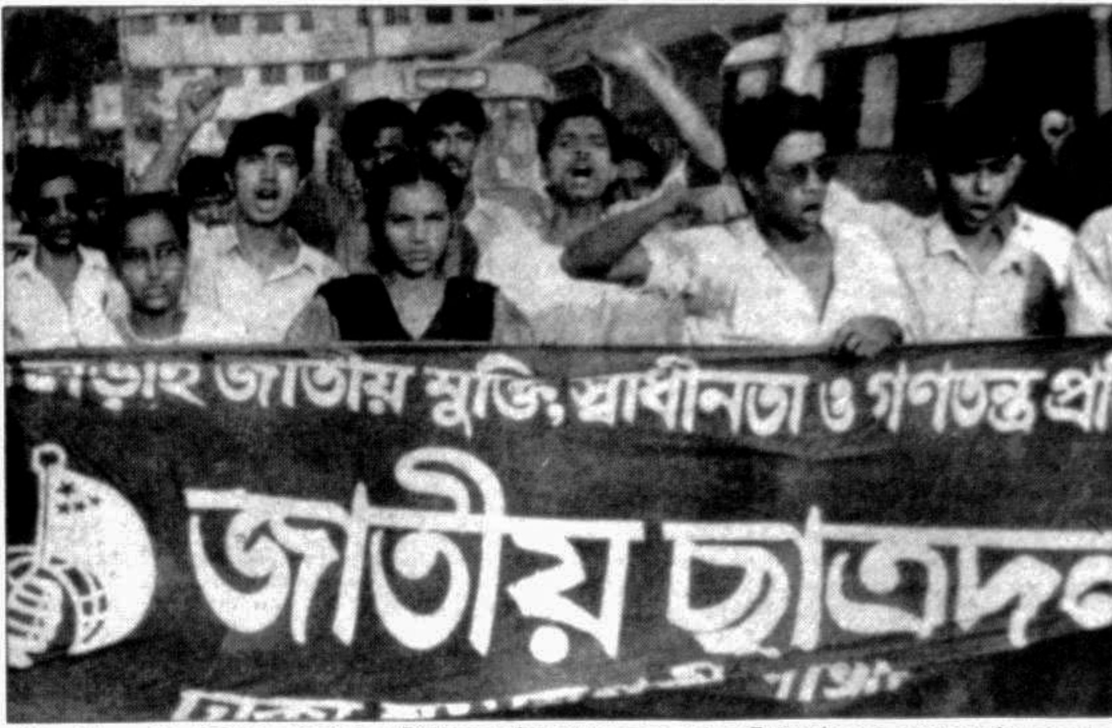
The city unit of Jatiya Chhatra Dal brought out a procession Saturday to protest the rise in prices of essentials.