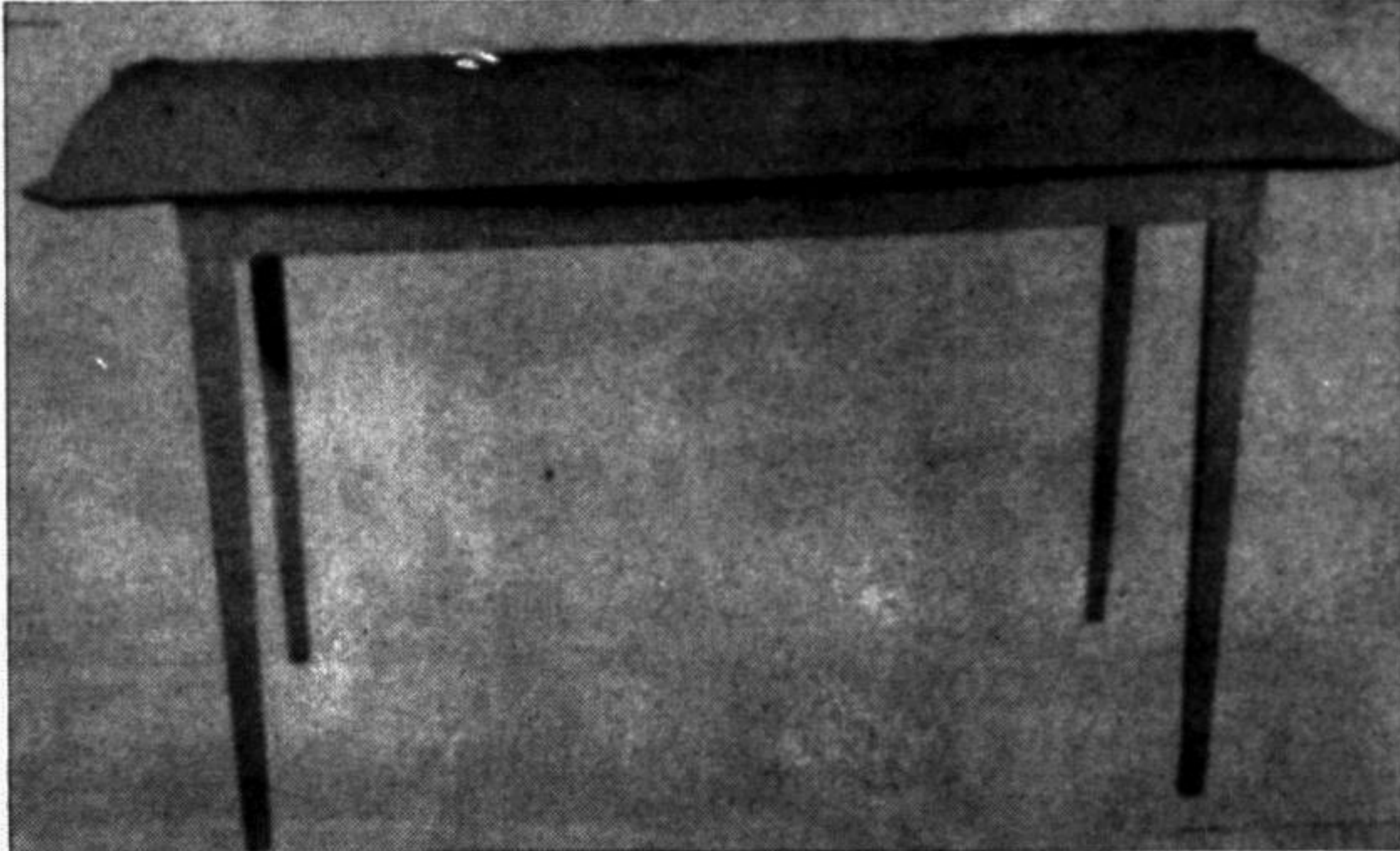
The table used during the signing of the documents of surrender by the Pakistani forces on December 16, 1971.