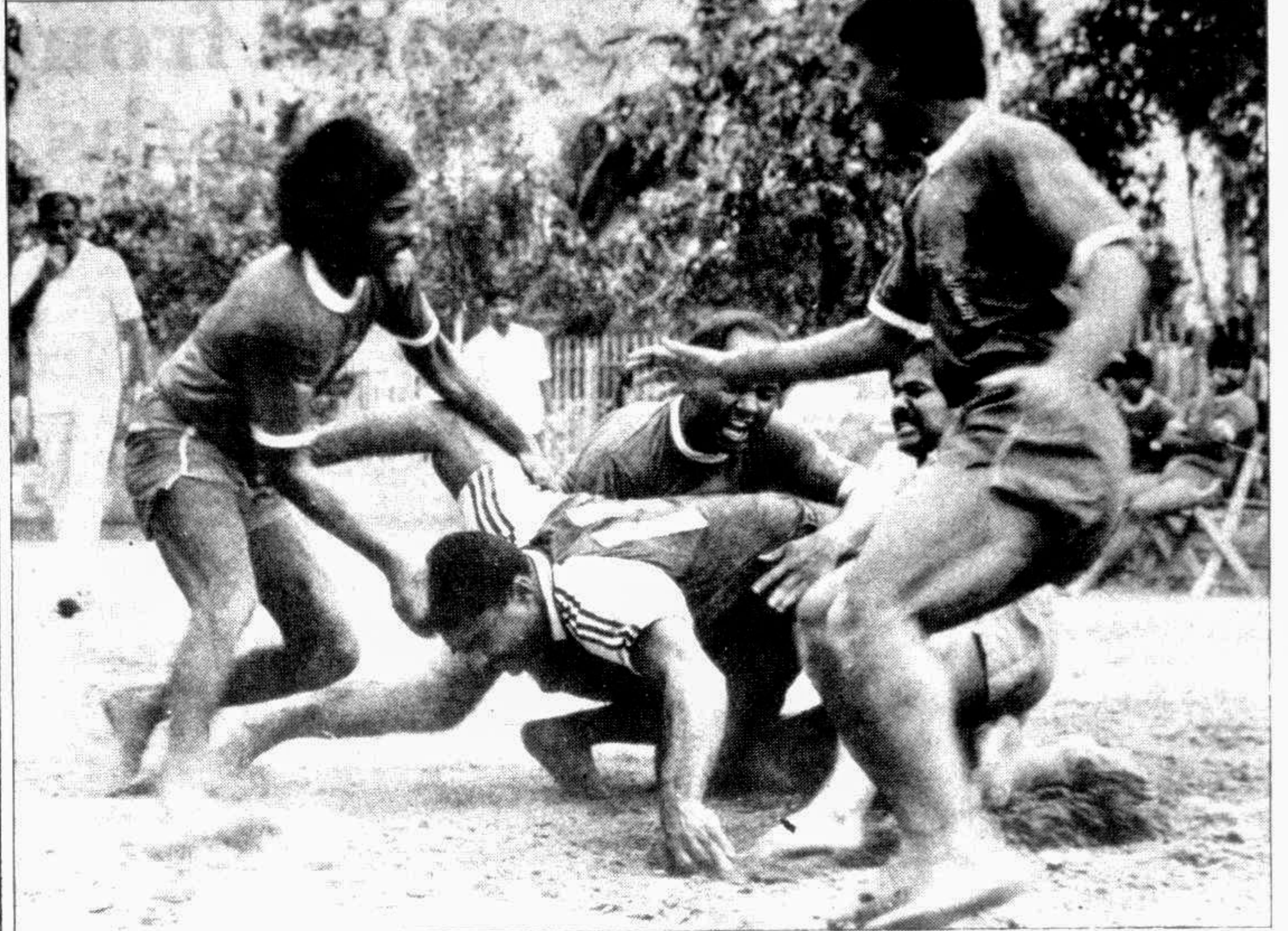
No escape for the fellow: Action from the Independence Day kabaddi semifinal between BDR and Ahmed Bawany Textile Mills at the Outer Stadium yesterday.

HANOVER, Germany, Mar 29: Police arrested 78 hooligans as three policemen and a horse were badly injured when fighting broke out during a Second Division football match between Hanover 96 and Eintracht Brunswick here on Thursday night, reports AFP.