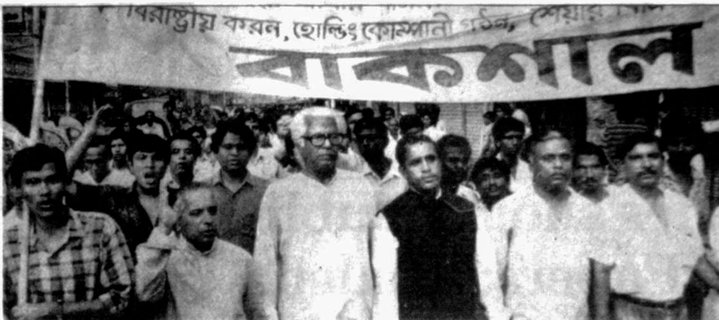
Bangladesh Krishak Sramik Awami League (BKSAL) brought out a procession in the city on Thursday protesting price-hike and water scarcity.

Sponsored jointly by the M. P. club and the Asia Foundation, the programme includes orientation on the constitution of Bangladesh, the rules of procedure and privileges and other matters related to Parliament, a club press release said.