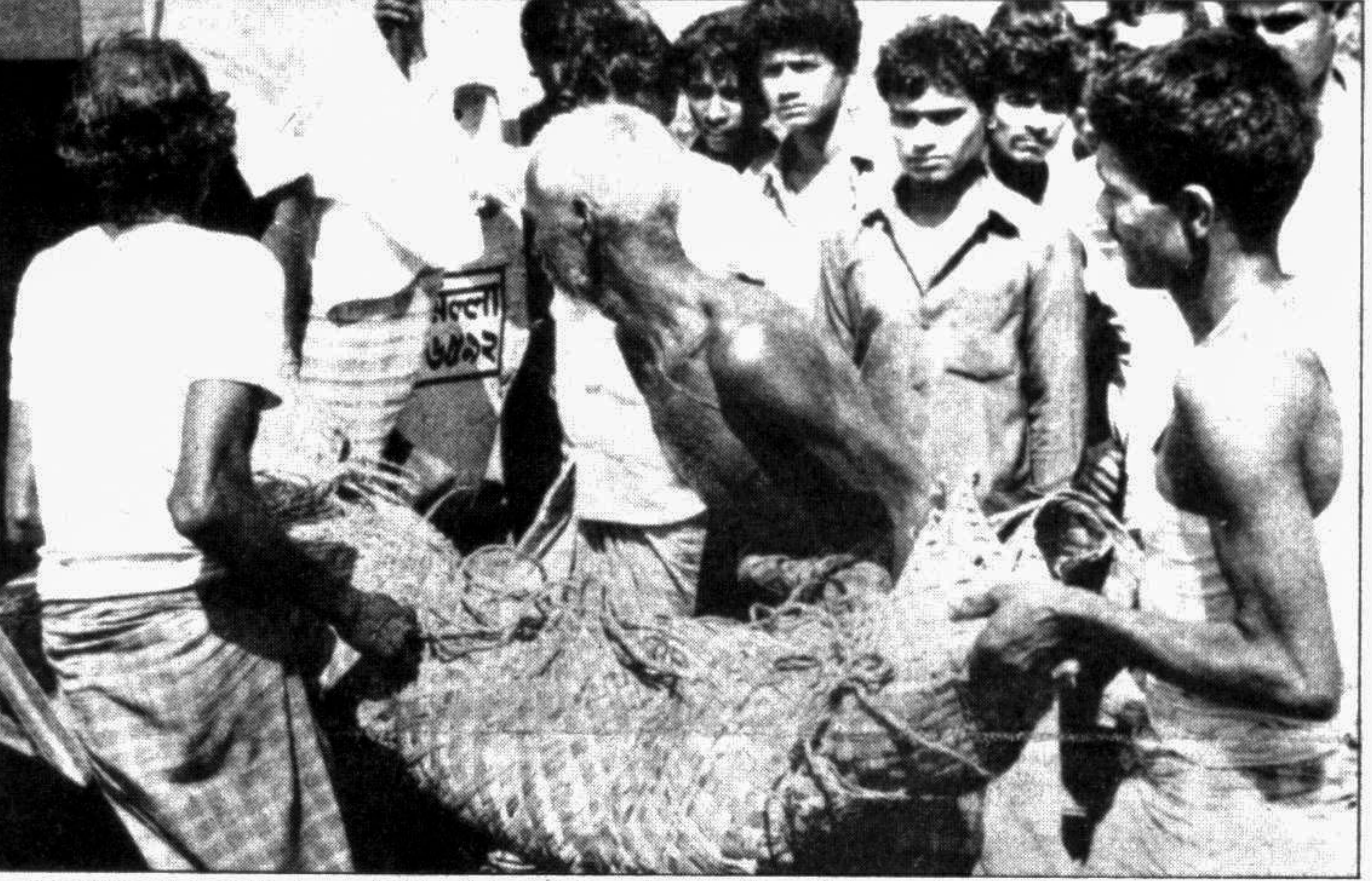
Body of one of the eight prisoners killed in firing by jail guards at Comilla on Wednesday being lifted in a van yesterday.