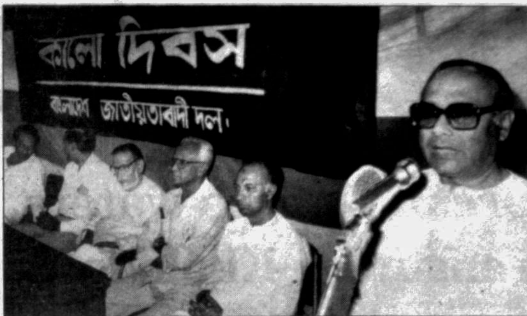
The BNP Secretary-General Abdus Salam Talukdar addressing a party discussion meeting in Dhaka on Sunday on Black Day

The new members of JCD brought out a possession the campus after filling up the membership form of JCD.