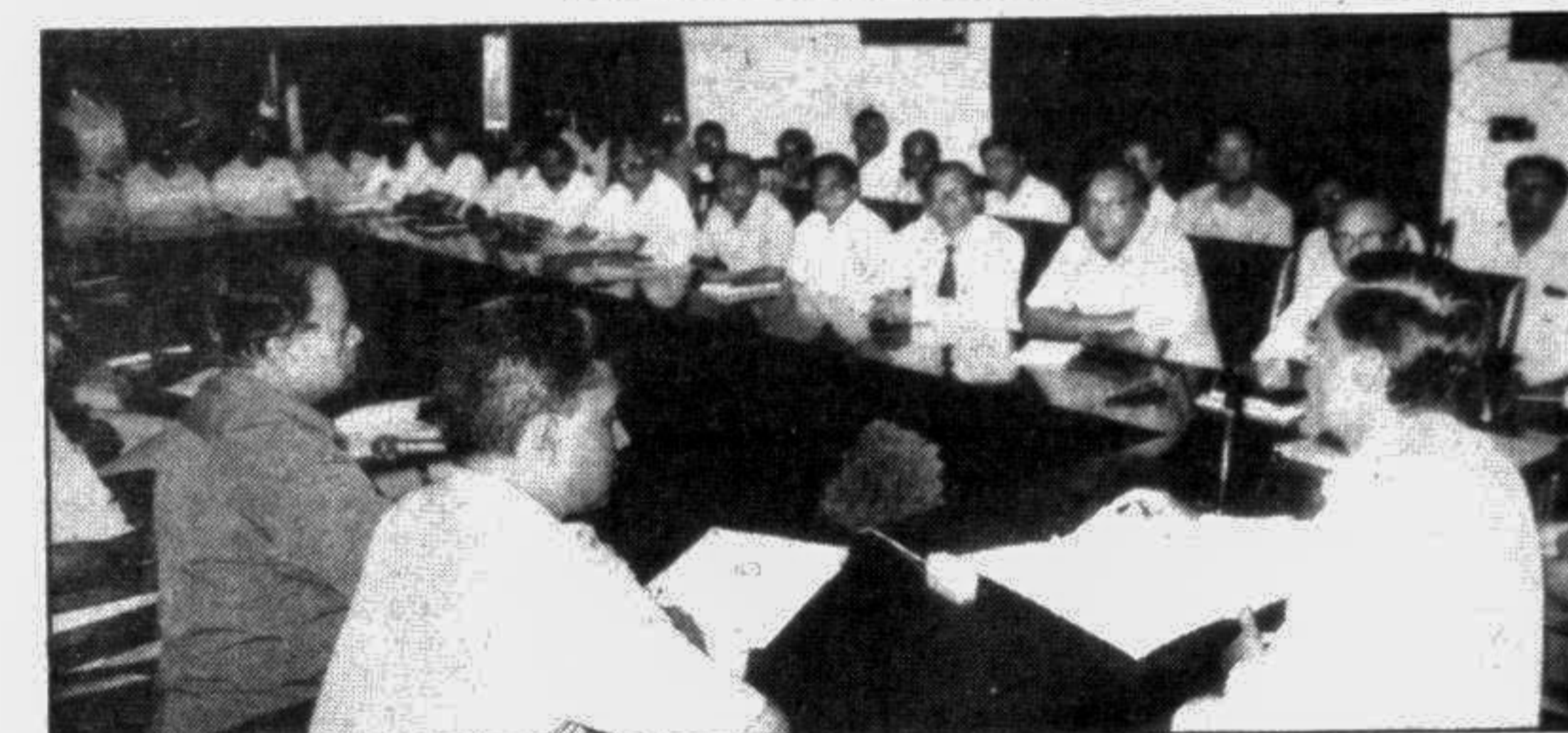
Communications Minister Col. (Retd) Oli Ahmed addressing the senior officials of Railway Division and the Bangladesh Railway at Kamalapur Railway Rest House, Dhaka on Sunday.