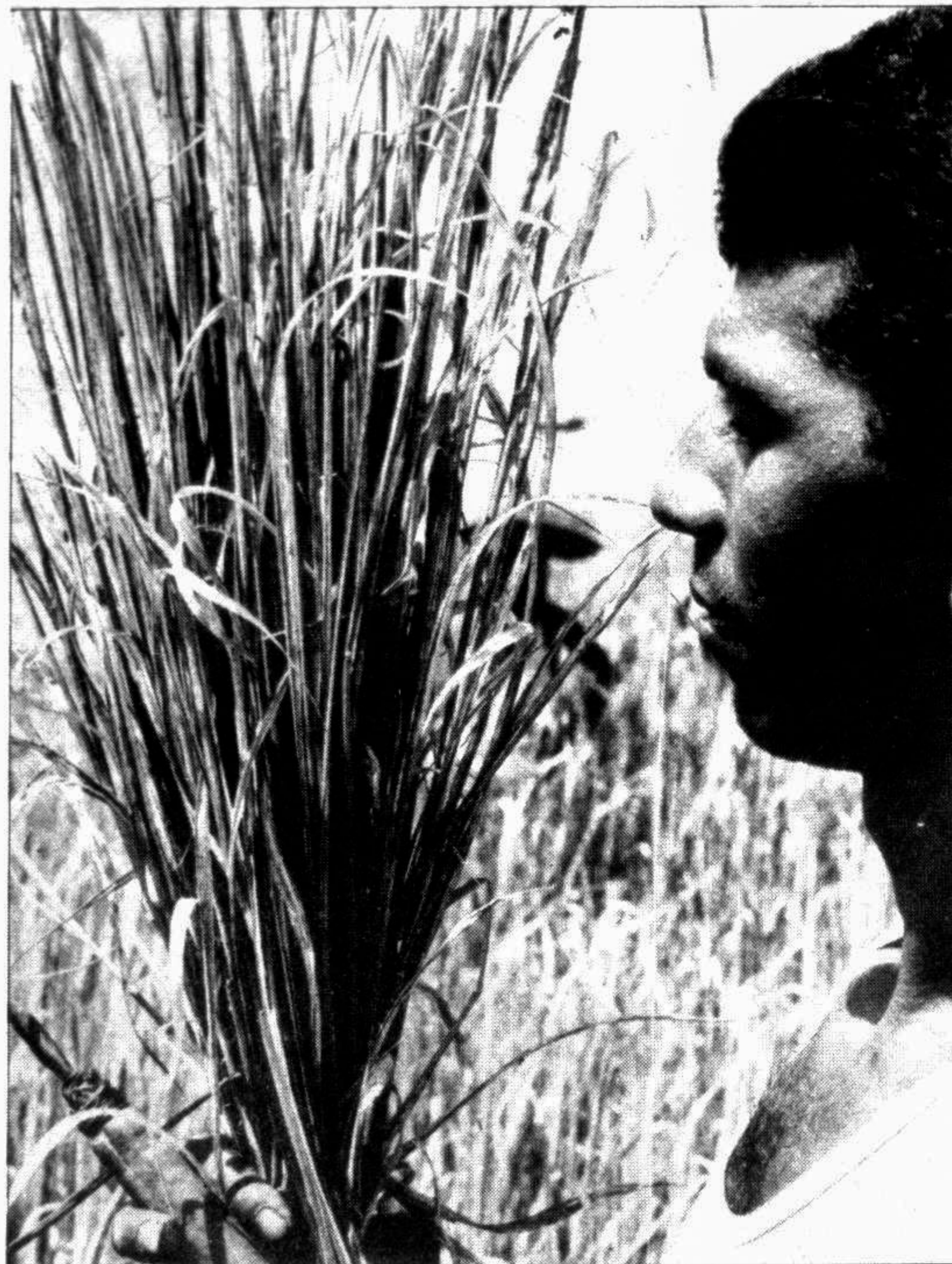
Crops on a vast tract of land are damaged due to pest attack every year. For want of insecticide peasants cannot protect the paddy plant from the menace. Here an anxious farmer holding a bundle of boro paddy sheaf infested by pests locally known as 'Mazra Poka' at a village in Narayanganj.

The programme included a seminar on 'Education and democracy' and a series of competition on different cultural events such as kerat, debate, speech, Rabindra-songs, Nazrul-songs, guitar and dances. The best college, school (boys), school (girls) and madrasa were Pabna College, Pabna, Government Nazimuddin High School, Ishurdi, Government Girls High School, Pabna and Boalmari Senior Madrasa, Santhia were adjudged best college, school (boys), school (girls), and Madrasa respectively.