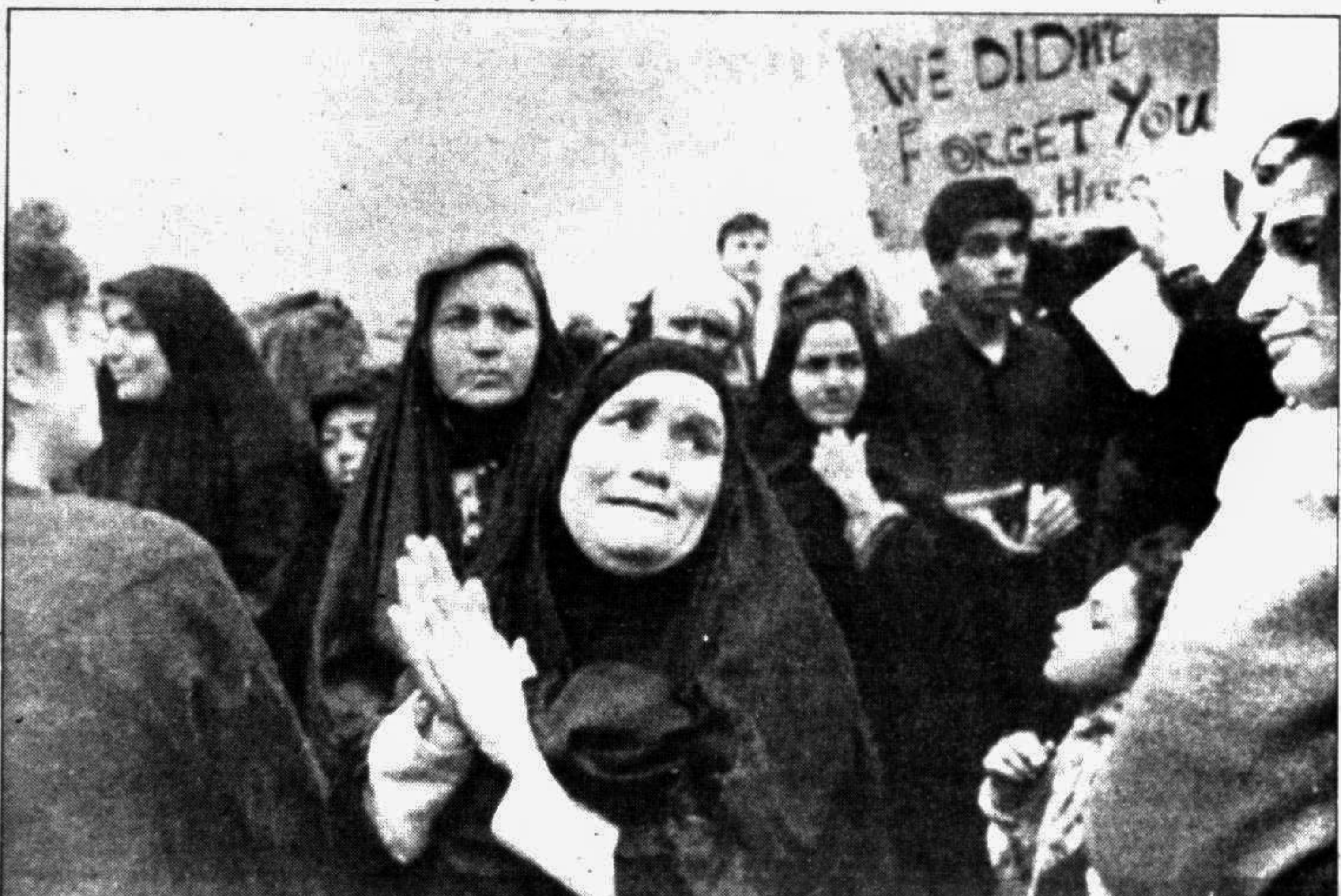
A woman anxiously awaits news of a relative she hopes is among 1,100 Kuwaiti prisoners of war released from Iraqi captivity.

Kut, Nasiriyah, Amarra and Basra in the south and from a northern region" which was not identified, the opposition "Voice of the Revolution" radio said.