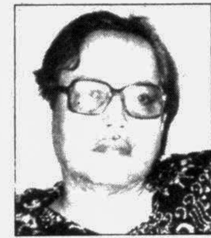
Dr Badruddoza Chowdhury