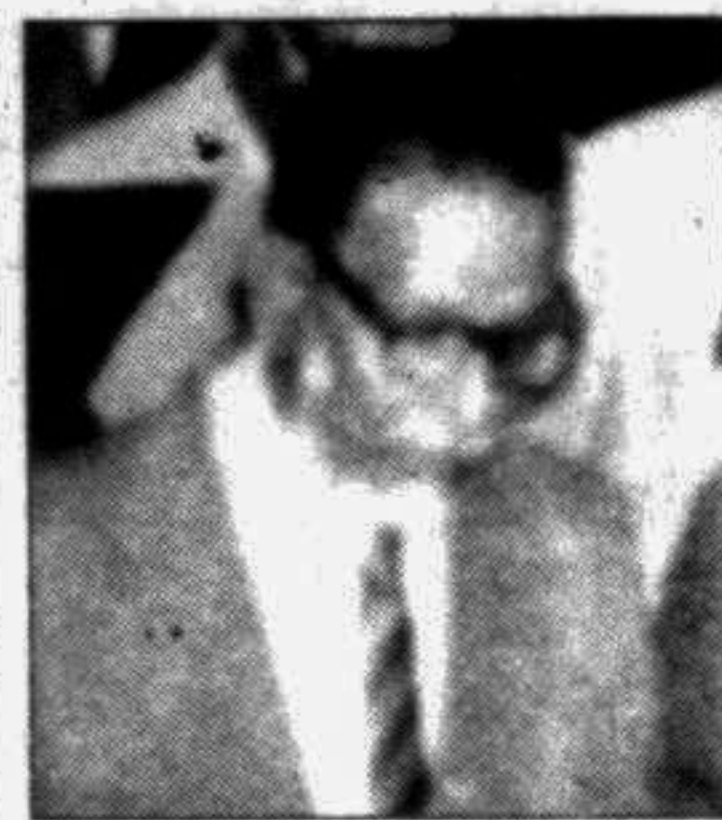
Mirza Golam Hafiz