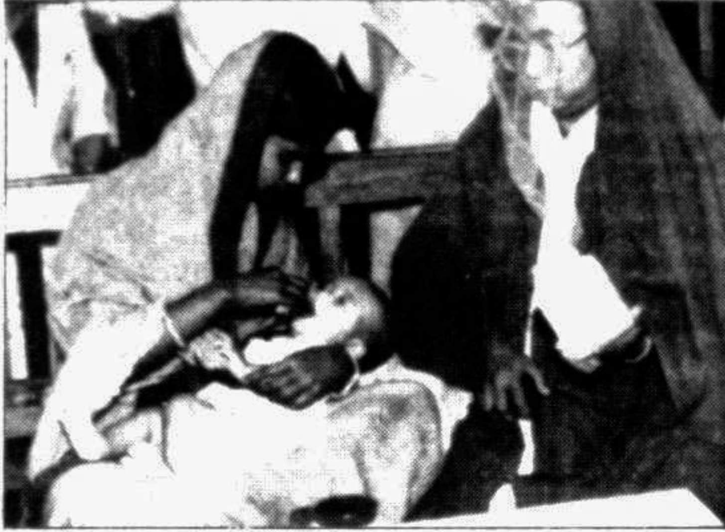
An afflicted child being given ORS.

With experts from abroad coming and training at the ICDDR,B, the Mohakhali and Matlab centres are providing a boon for "runny tummy" sufferers. With a shortage of doctors and hospitals in the country, this centre has answered many problems of the people in and around Dhaka. As for the Matlab hospital, where there are further services of child immunisation and family planning, an ideal atmosphere for the ailing and not so well off is constantly being maintained.