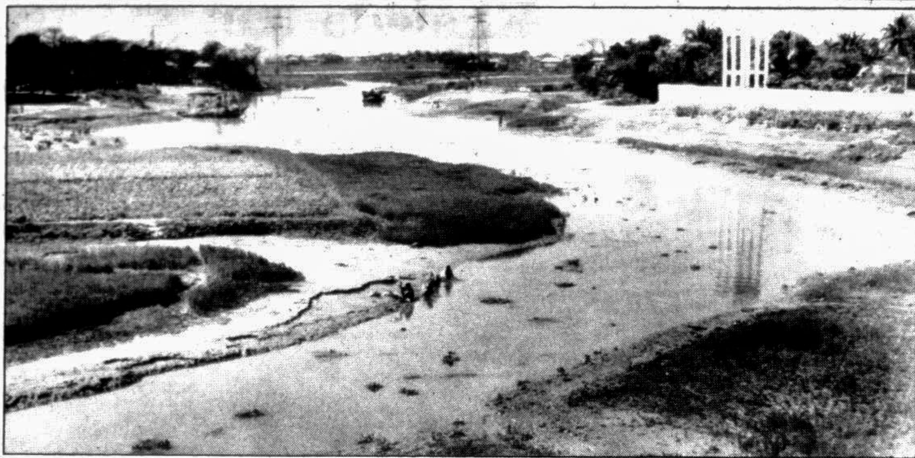
NARAYANGANJ: During the dry season rivers and other water bodies recede alarmingly and there emerge chars and shoals. Here in a char at the mouth of the Sitalakhya farmers, however, have cultivated vegetables and other crops.

Witnesses said, a gang of armed dacoits numbering 15 to 20 Friday night raided the house of Amanullah at village Maluchi and looted gold ornaments, watches and other belongings. The miscreants also beat up four inmates of the house when they tried to raise alarm. While decamping with the booties, the villagers chased the dacoits and caught hold one of them. According to police, five people including one dacoit were injured in the incident.