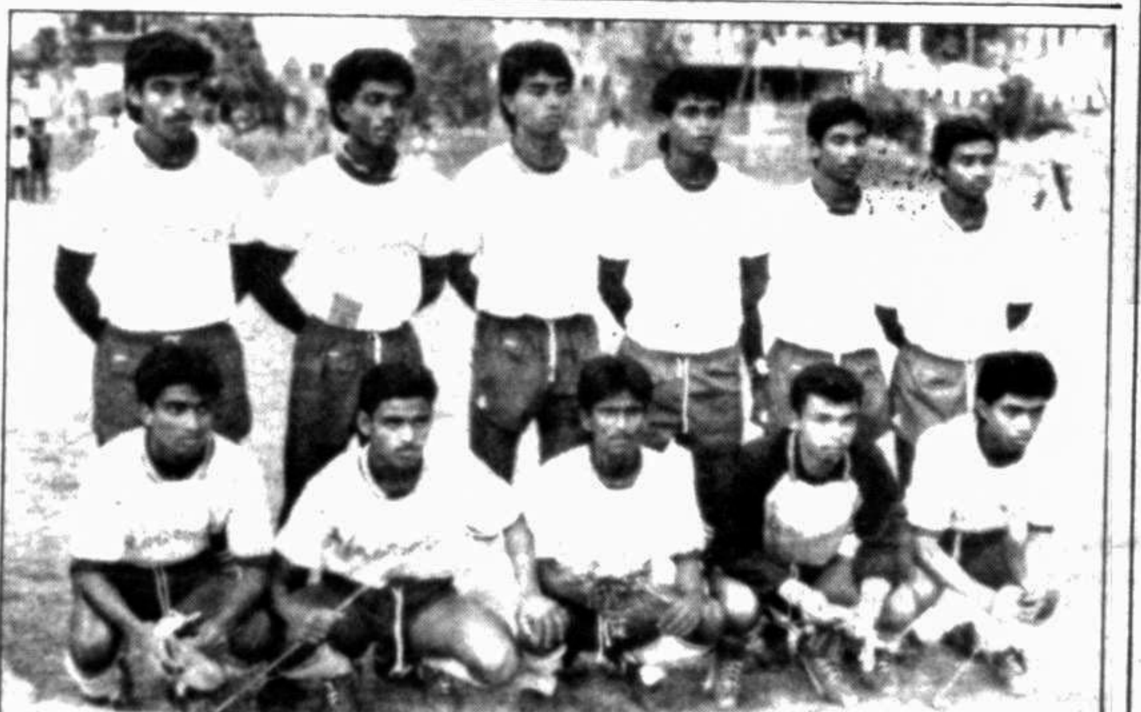
Pioneer soccer runners-up Bashabo Tarun Sangha who along with Gandaria Famous Sporting, will play in Division Three next season.