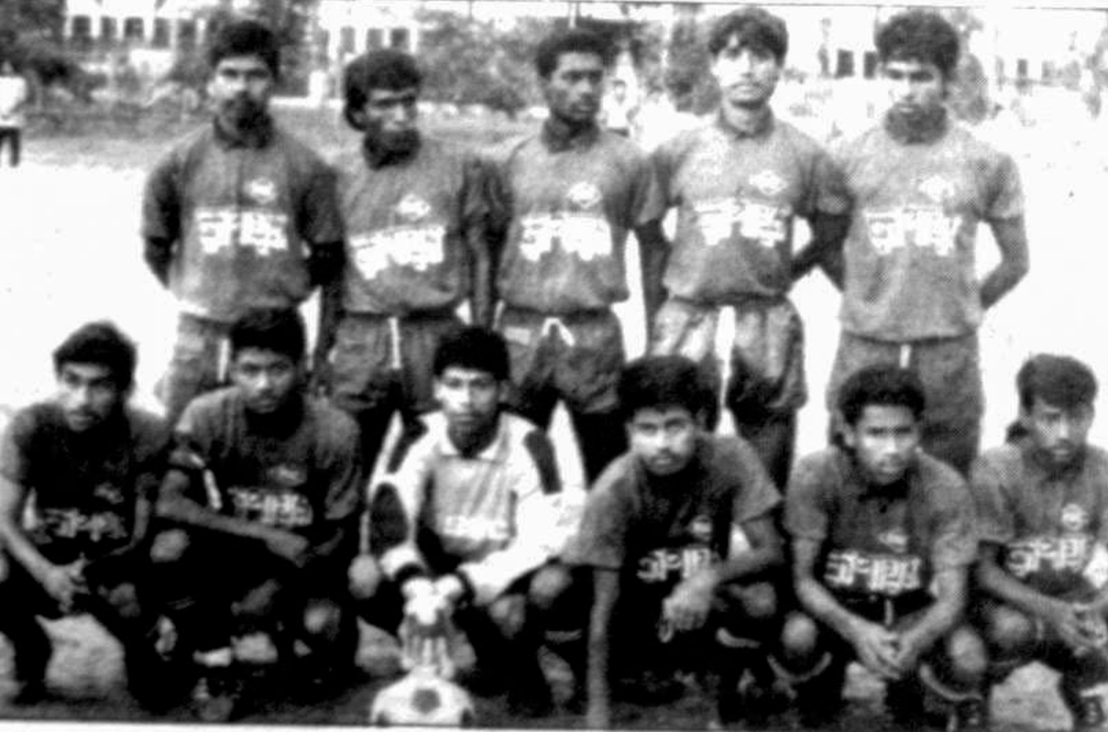
Gandaria Famous Sporting became the Pioneer soccer league champions beating Bashabo Tarun Sangha in yesterday's final at the Outer Stadium.