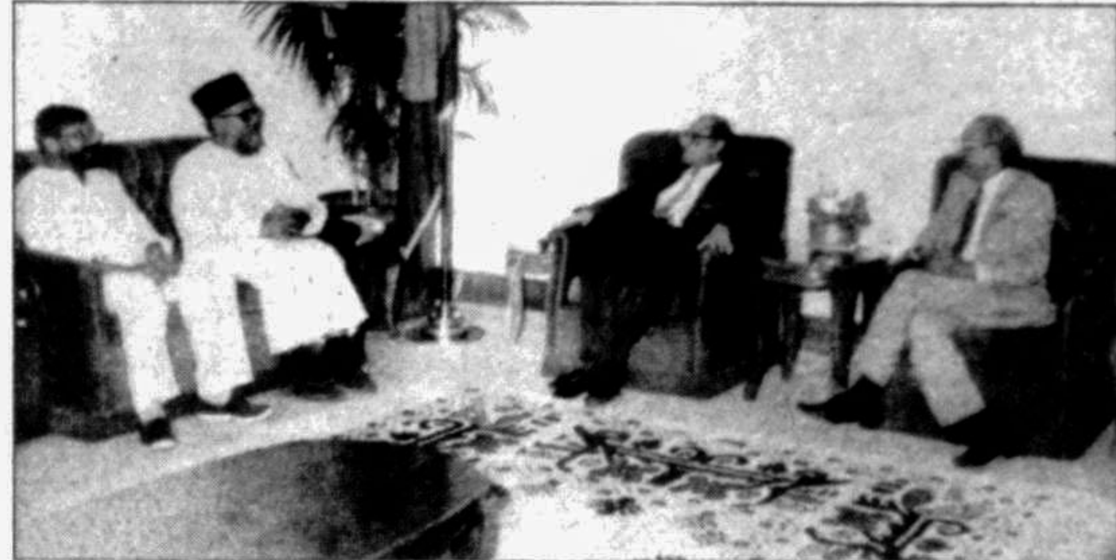
Secretary General of Jamaat-e-Islami Bangladesh and leader of Jamaat PP Maulana Matiur Rahman Nizami called on Acting President Shahabuddin Ahmed at President's Secretariat on Monday.

Attention of all those members who have been elected from more than one constituency has been drawn to Article 71 of the Constitution. Under this article a Sangsad member elected from more than one constituency will See Page 10 Col 1