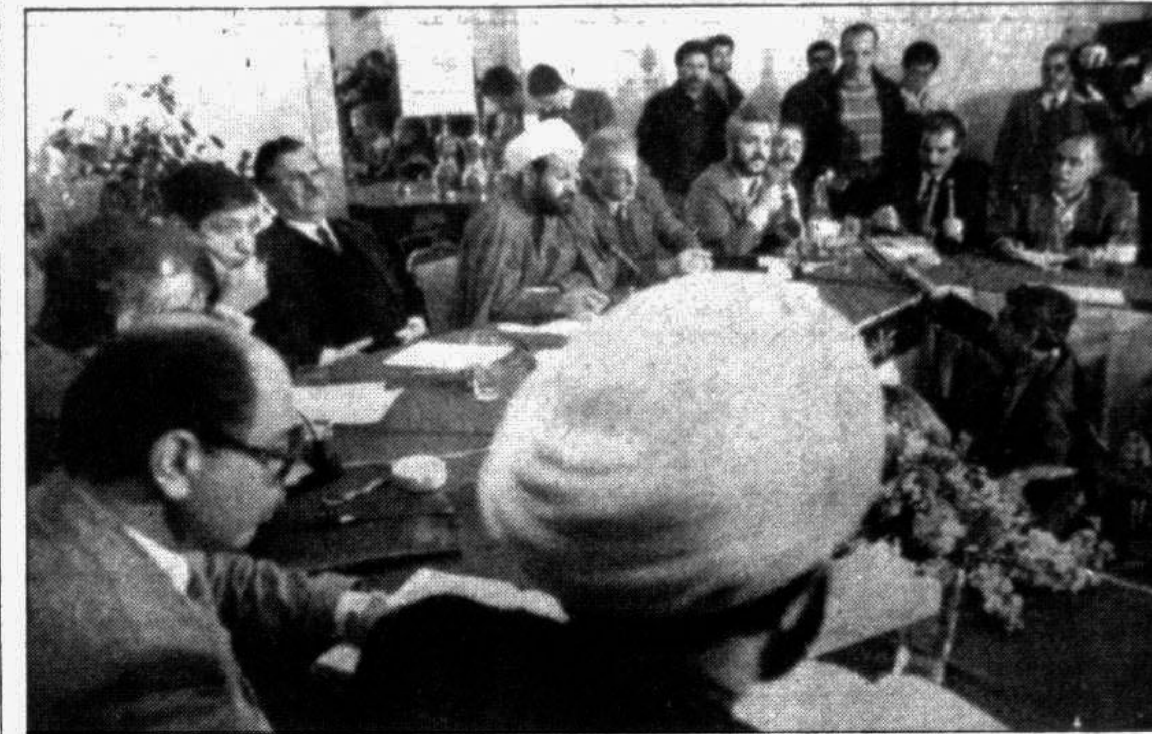
Representatives of Iraqi opposition movement based in Damascus at a press conference on March 7 affirmed that they would continue the uprising in Iraq until Saddam's fall.

In Khulna various socio-cultural organisations observed the day through holding rallies and seminars.