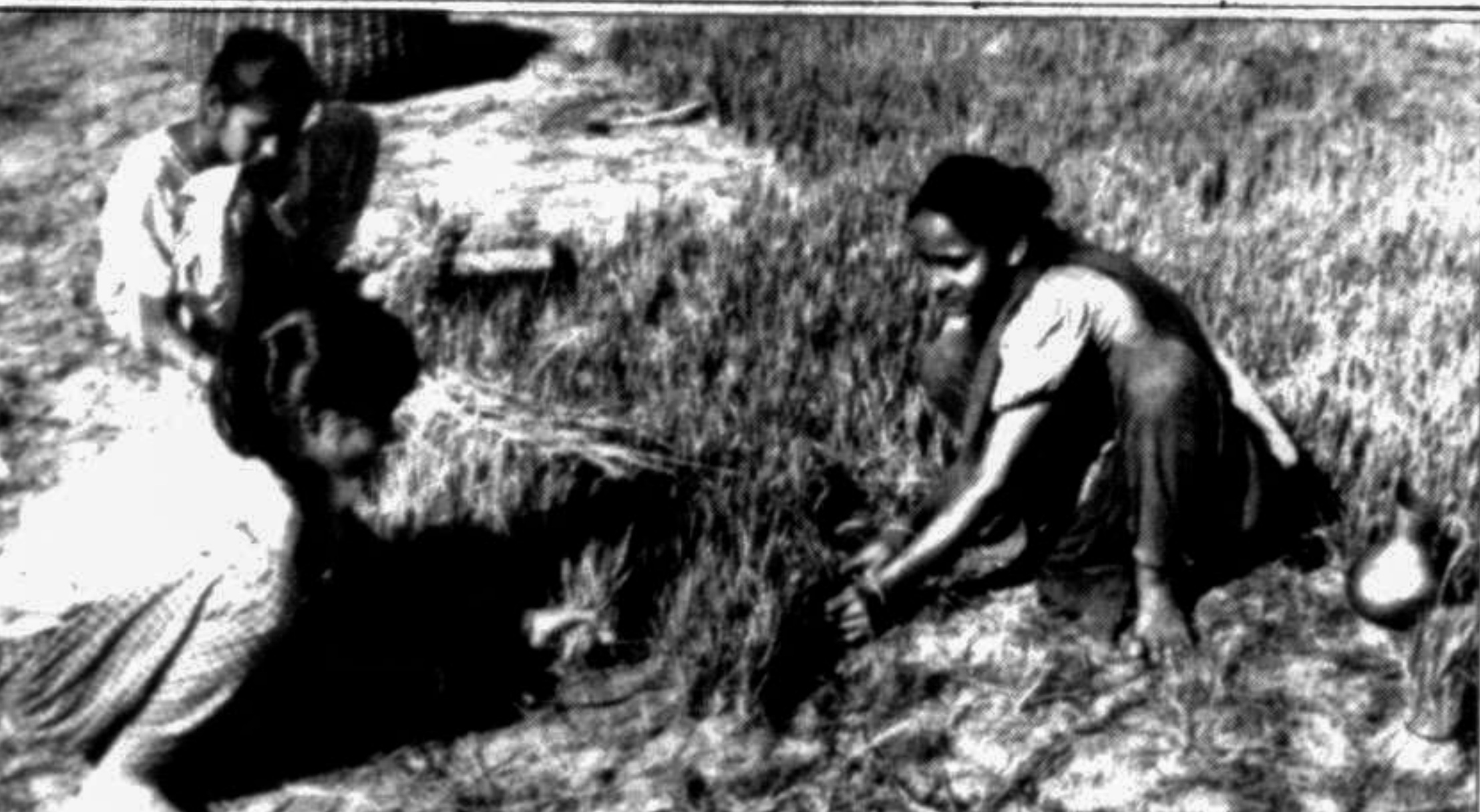
Before farming paddy seedlings are produced in separate land. Here in a Jamalpur village girls are uprooting IRRI seedlings.