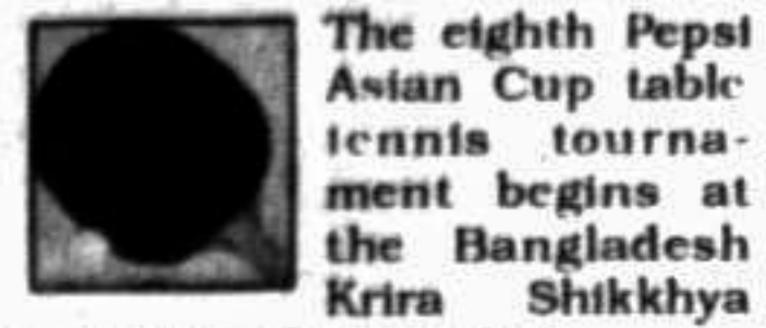
The eighth Pepsi Asian Cup table tennis tournament begins at the Bangladesh Krira Shikkhya Pratisthan, Savar today.