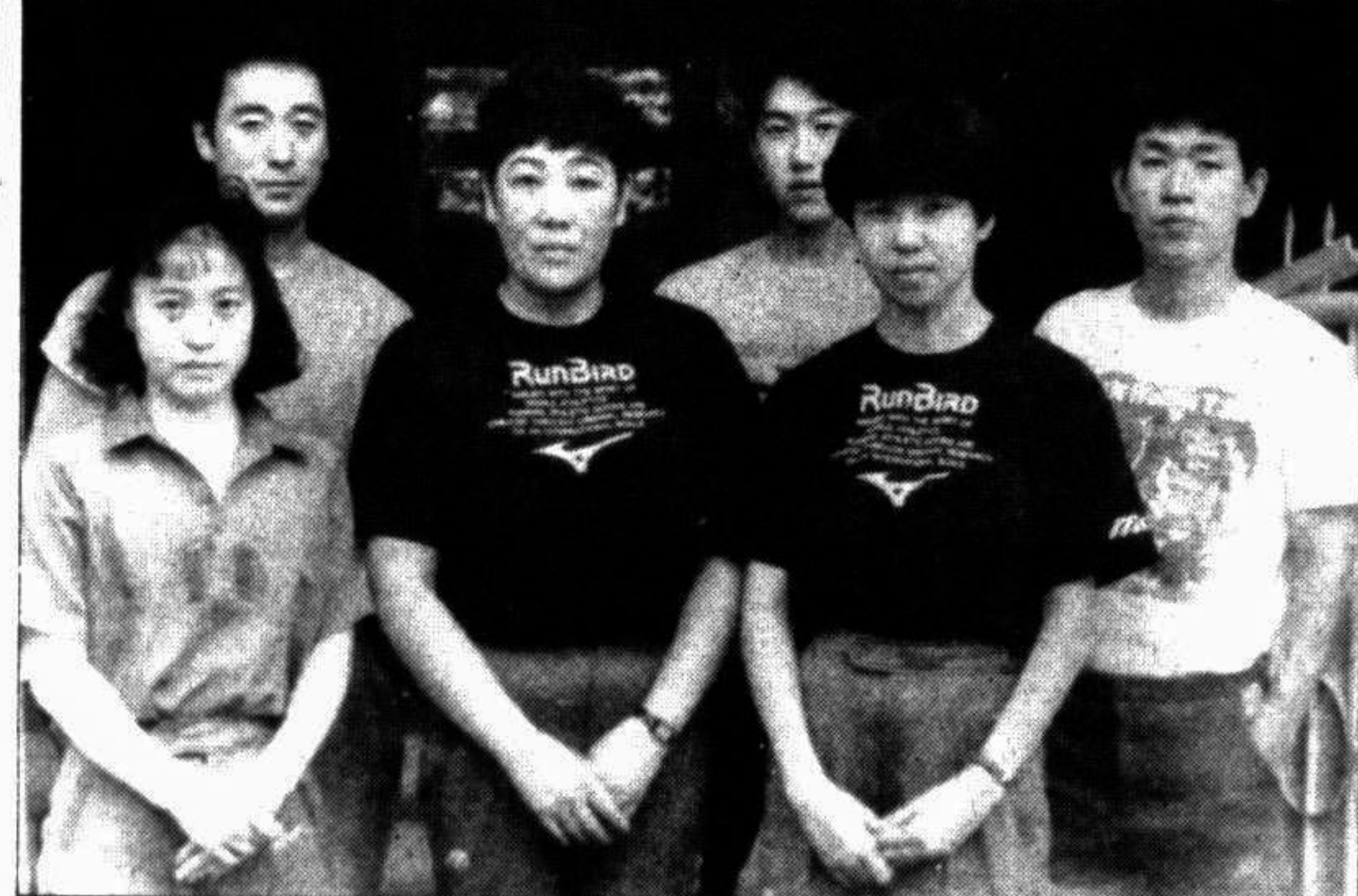
The participants in the eighth Pepsi Asian Cup table tennis tournament on their arrival at Zia International airport yesterday. From top: Chinese Taipei, South Korea and Pakistan. The Japanese team, pictured at bottom, arrived late Monday night. The ten-nation meet begins at the BKSP indoor gym, Savar, today.