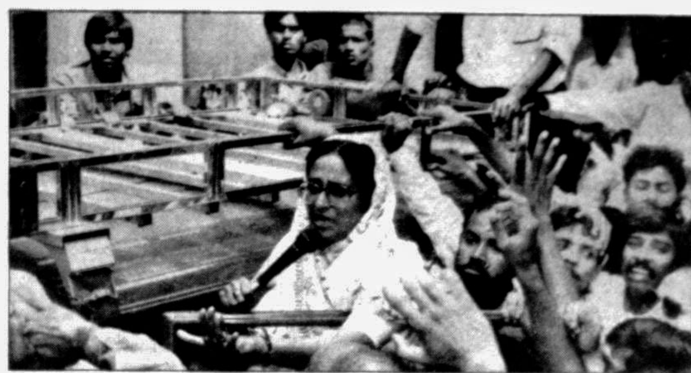
AL leader Sheikh Hasina speaking to agitating party workers on Monday after report of her resignation.