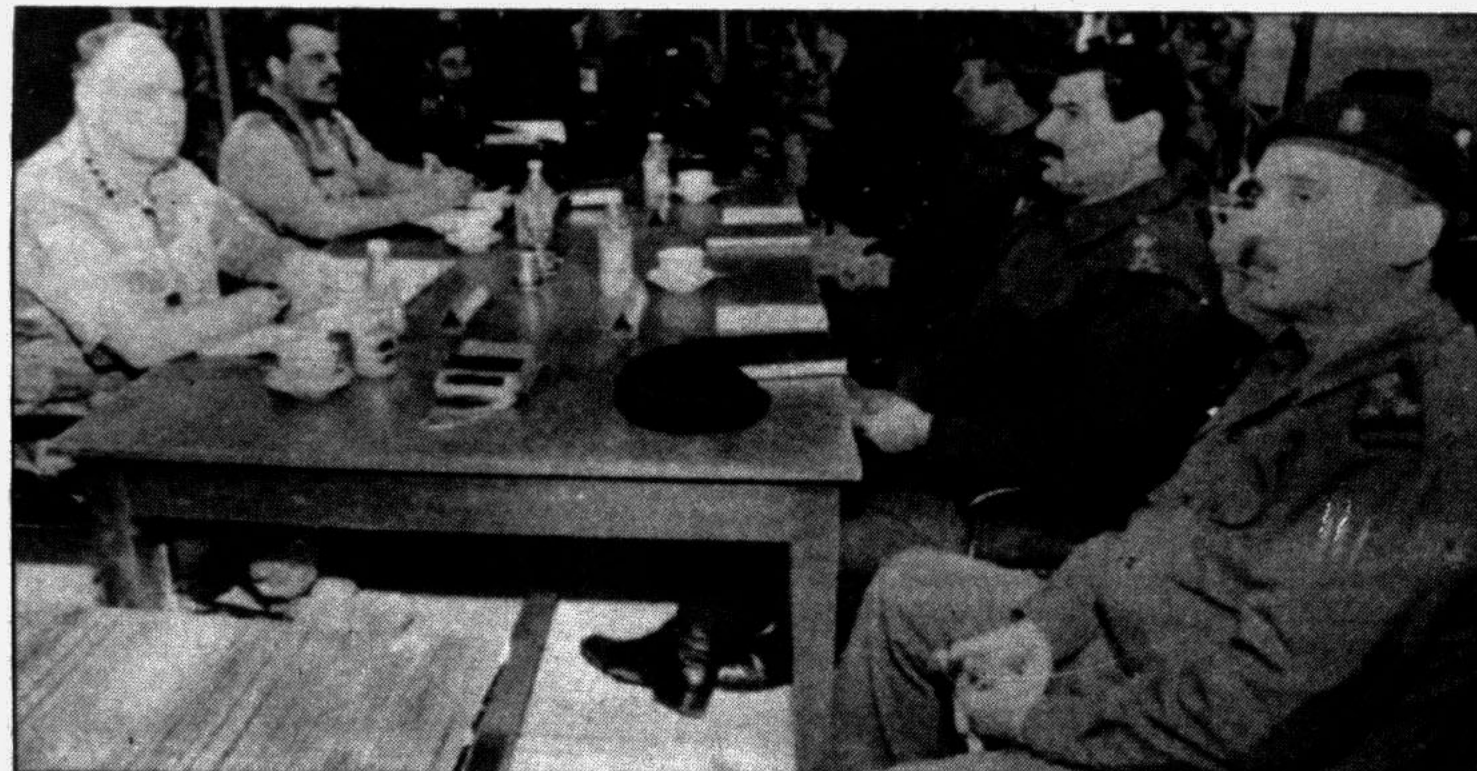
US Gulf Commander General Norman Schwarzkopf (L) and Saudi General Khaled bin Sultan (2nd L) discussing formal ceasefire with Iraqi generals on Sunday.