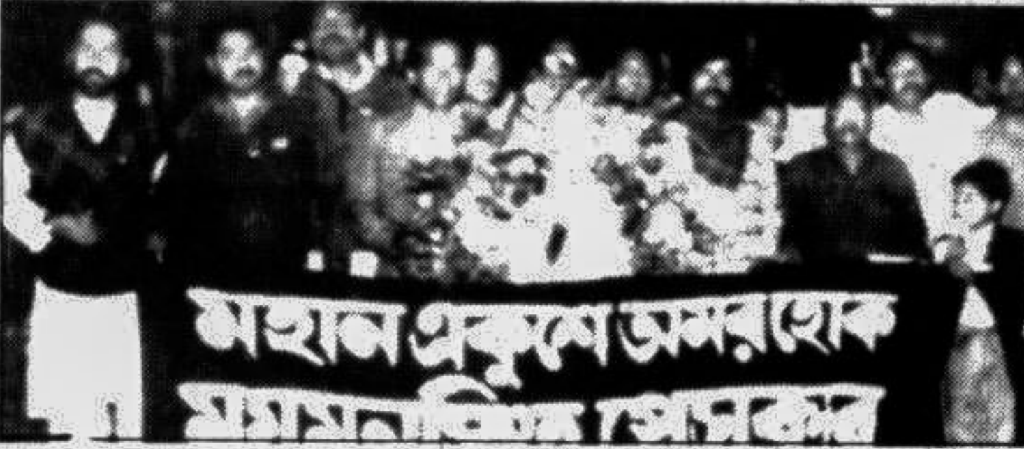
MYMENSINGH: Members of the local Press Club marching towards Sheheed Minar to lay wreaths on the occasion of Ekushey February.

A Correspondent from Gouripur (Mymensingh) adds: