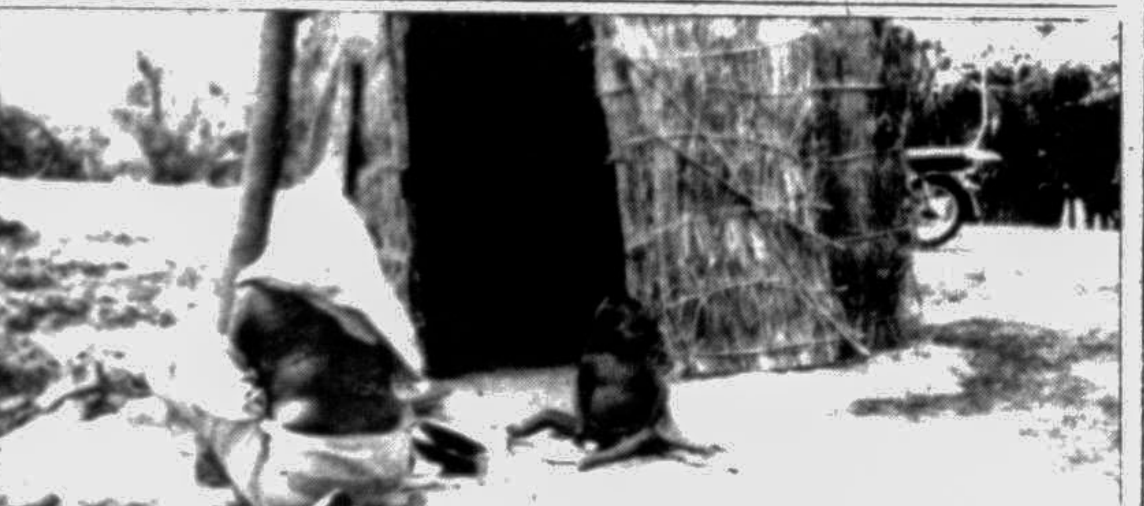
PABNA: Population boom, natural calamities and other factors made many a people homeless. Here this woman is cleaning utensils near her thatched hut beside a highway while her husband is out for a day's earning.

PATUAKHALI, March 3: According to the decision of the present caretaker government, a total of 69 prisoners have been freed from Patuakhali district jail.