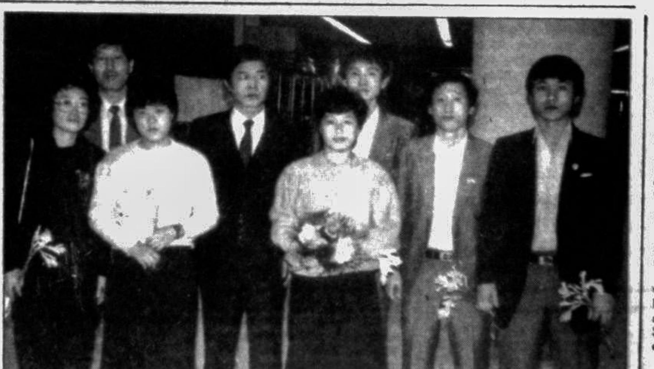
The eight member Chinese table tennis team arrived in the city yesterday to take part in the 8th Asian Cup table tennis tournament.

Meanwhile an earlier Reuter reports says: Sri Lanka made deep inroads into New Zealand's batting to have them 194 for five wickets in their first innings at the close of the second day of the third cricket Test on Saturday. In reply to