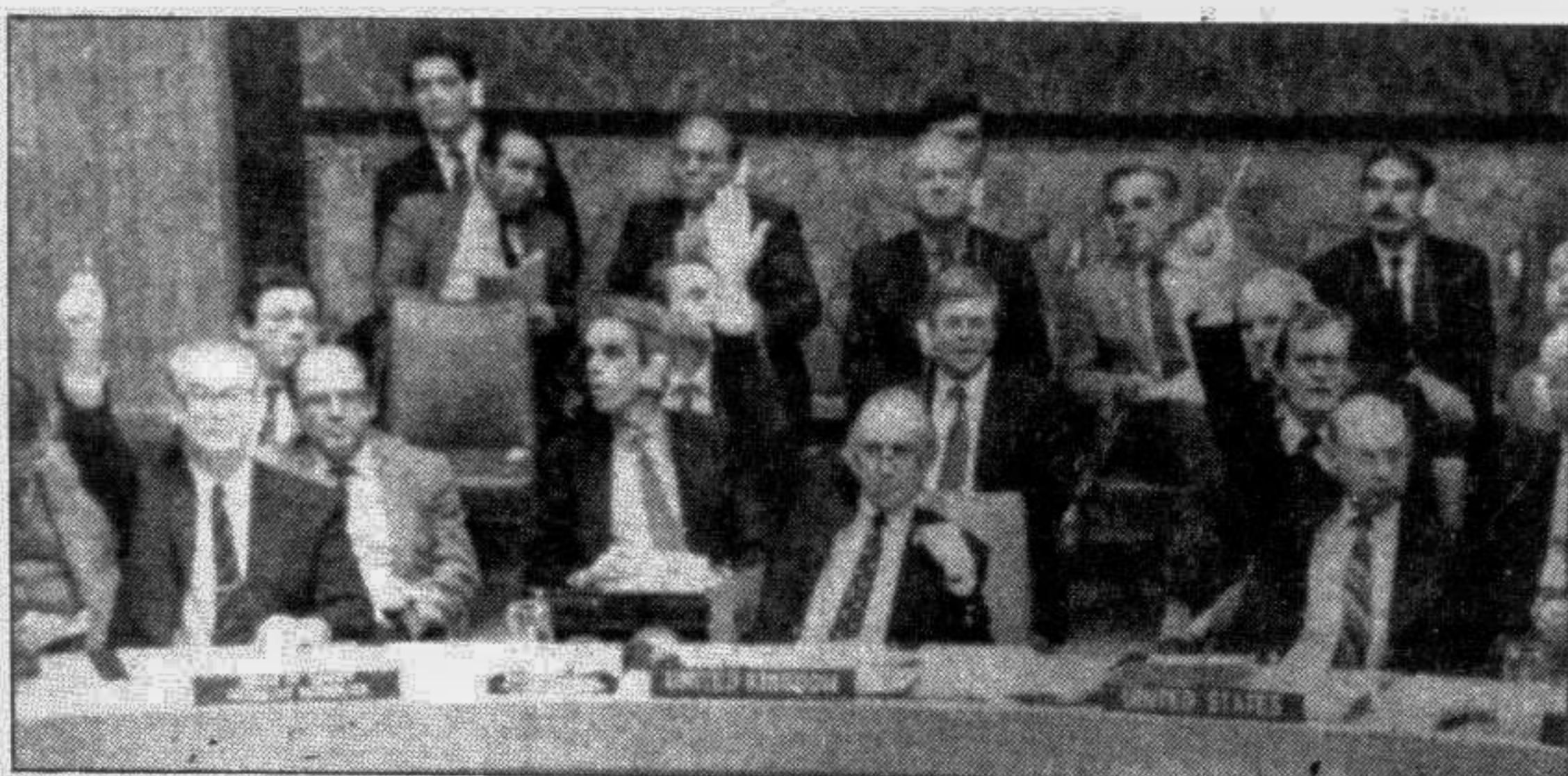
Ambassadors of Allied countries to United Nations voted Saturday for a Security Council resolution dictating demands to Iraq for a formal ceasefire in the Gulf war.