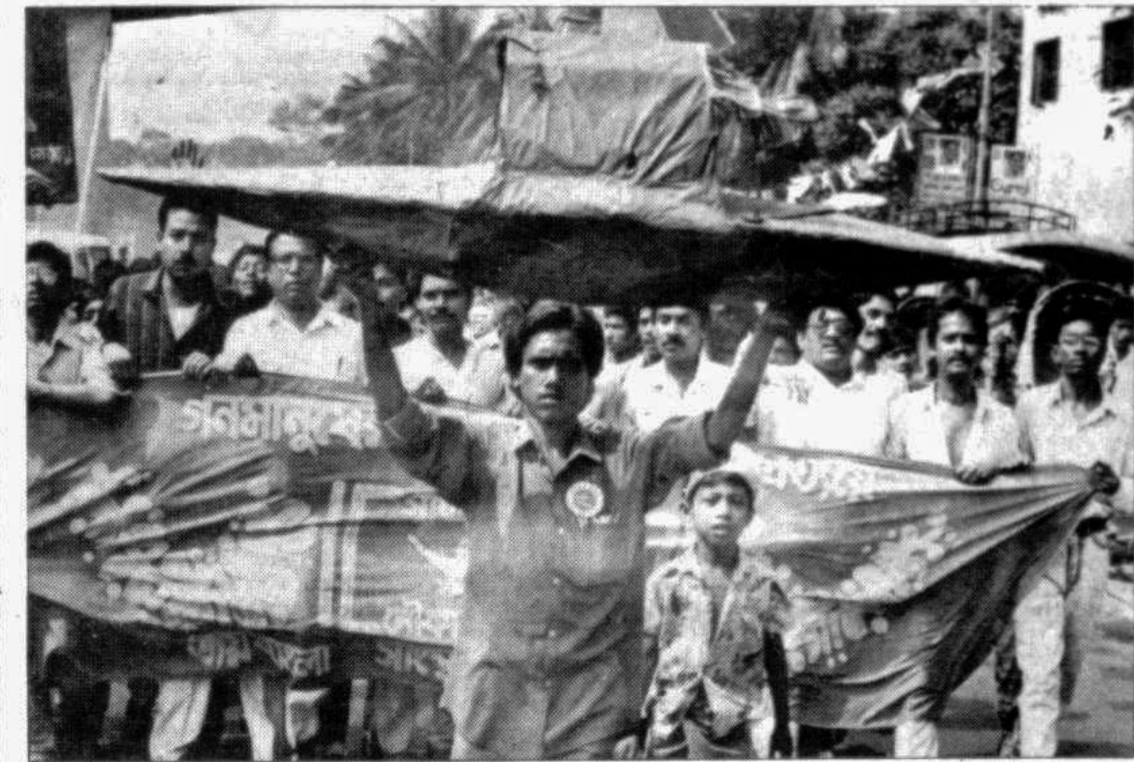
BOATS ON CITY ROADS — The Awami League supporters, holding aloft 'boat' seen making final appeal to voters to cast ballots in favour of AL candidates. The poll campaign officially concludes today (Monday).