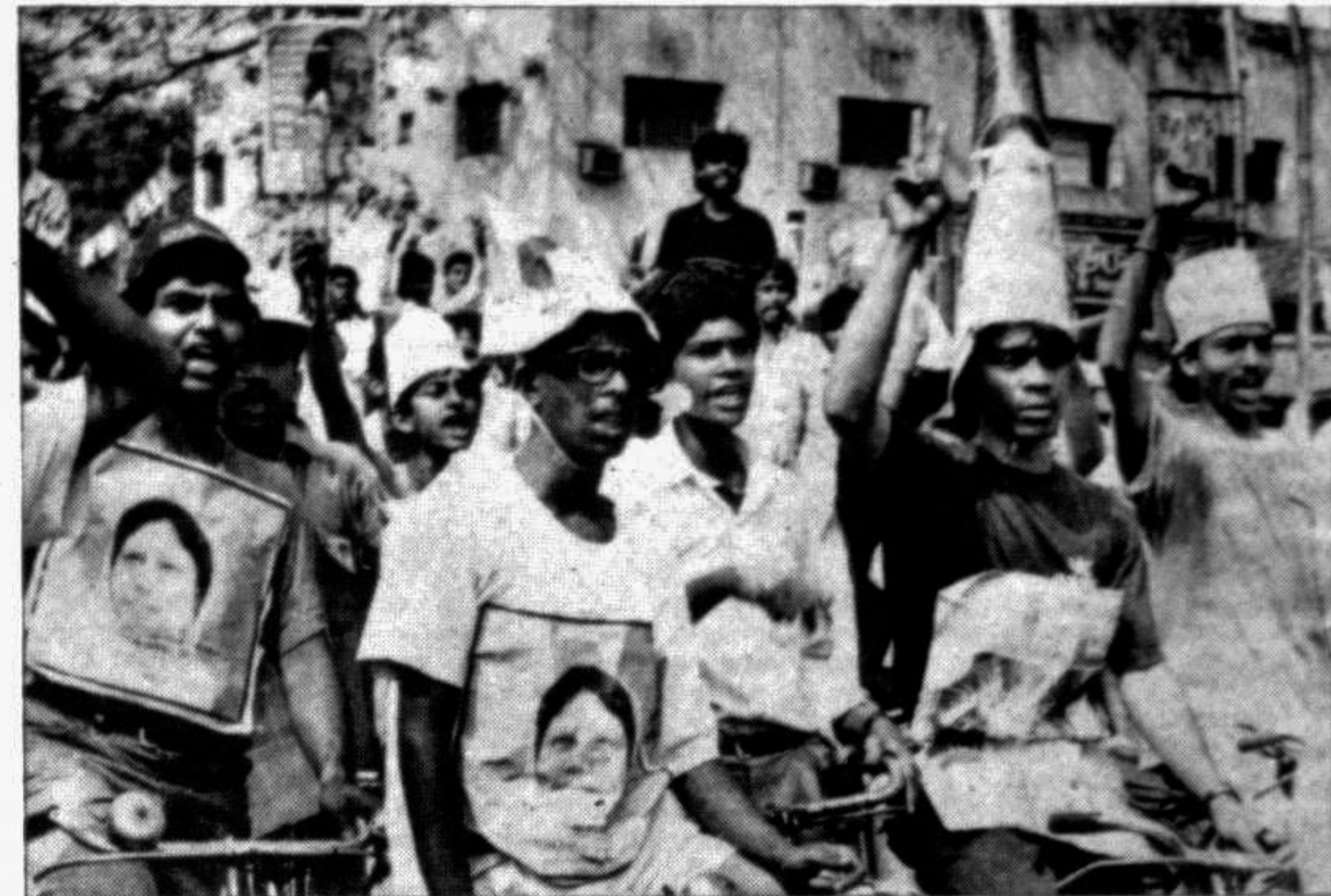
Hectic electioneering by the BNP activists with photos of Khaleda Zia pasted in their chests in city on Sunday.

The two constituencies in the metropolis from which Sheikh Hasina is contesting are: Dhaka-7 (Sutrapur-Kotwali) and Dhaka-10 (Tejgaon-Ramna). Begum Zia's constituencies are: Dhaka-5 (Gulshan-Cantonment) and Dhaka-9