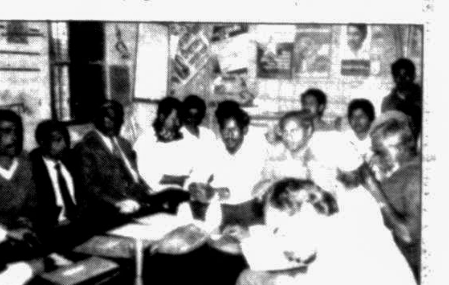
KURIGRAM: Leaders of zila 8,7 and 5-Party alliance leaders addressing a Press conference at the BSD office on February 18. - Star photo

According to official sources, at least 3200 metric tons of wheat have been sanctioned for the implementation of the projects. KURIGRAM: Leaders of zila 8,7 and 5-Party alliance leaders addressing a Press conference at the BSD office on February 18. - Star photo