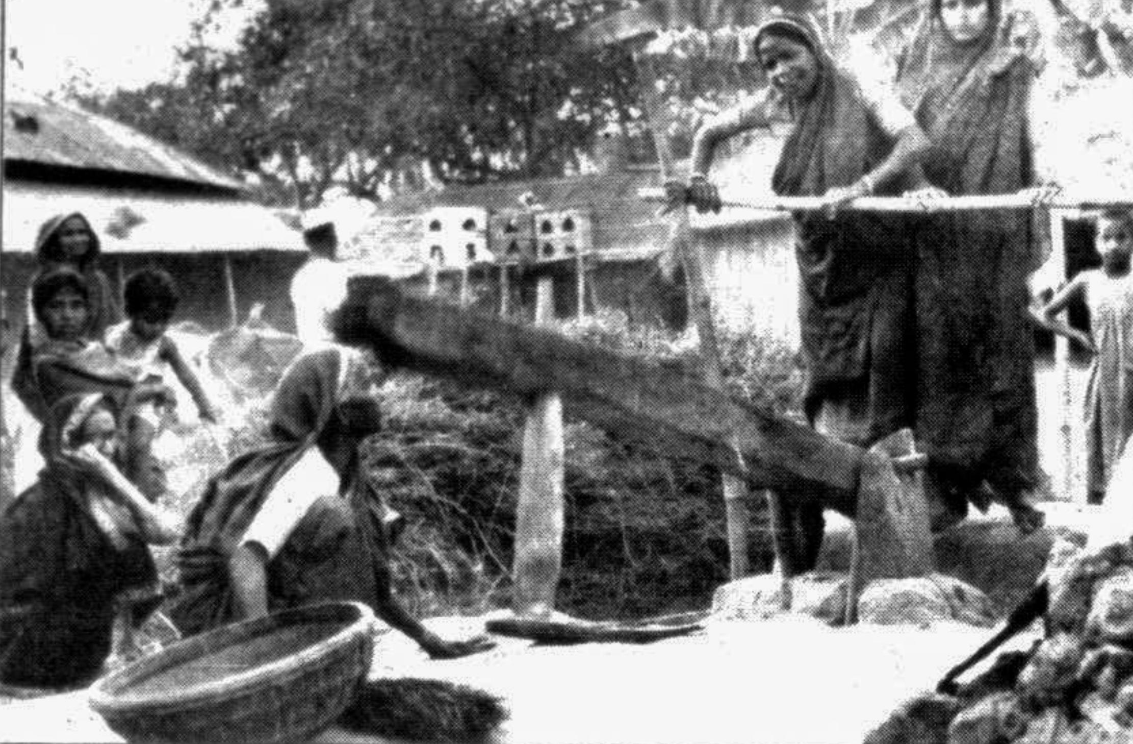
Modern equipment have replaced many indigenous tools used by the rural people. With the advancement of science 'Dheki', an indigenous tool for husking paddy has almost become obsolete. Women are seen using a 'Dheki' in a remote village at Gazipur district.

It is alleged the sanitary inspectors of pourashavas and upazilas are not examining foodstuffs to detect adulteration. Consequently the traders are continuing their illegal business freely. Besides, bandrollless bides are being sold openly in the town and village areas of the district. Dishonest traders are earning a lot of black money depriving the government a huge revenue worth lakhs taka per month.