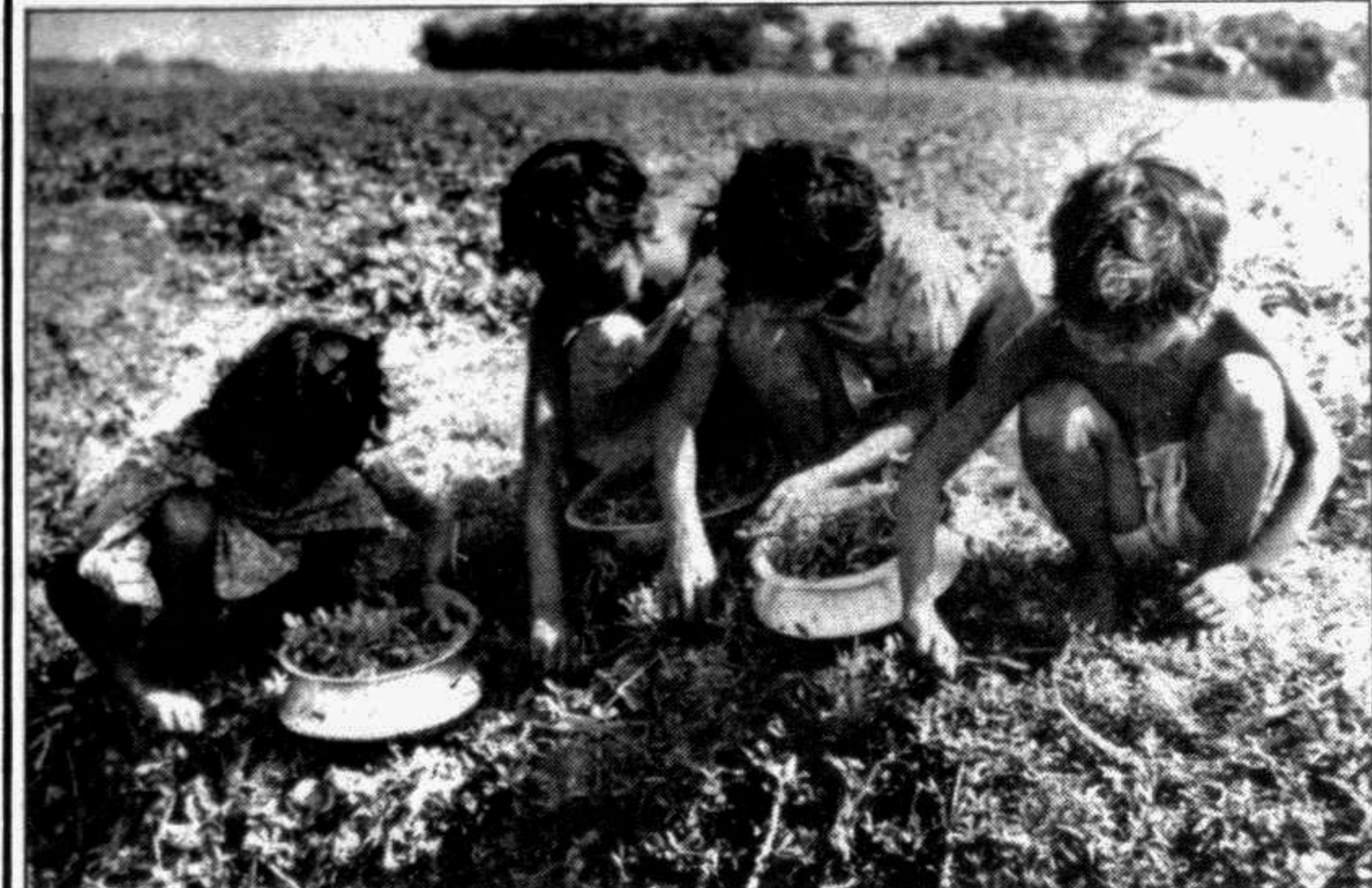
Collection of leaves from marshy tracts adjoining the metropolis by children and old women is a principal means of earning their livelihood. The vegetables leaves are taken to city markets by them for sale. In all the kutchas bazars and wayside places they sell their collection at cheap rate. At times leaves are not available due to drought or flood. Here they are seen engaged in collecting leaves at a place across the river Buriganga.