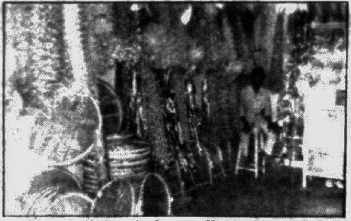
A typical 'zori' shop, offering materials meant for pre-wedding rituals.

The social practices are in exact contrast to the simple religious ceremony, and in cases border on the showy. While the upper class finds weddings an excuse to spend wildly, the middle class manages to find a reason to go on a shopping spree. In fact, shopping is more than half the fun, for ladies specially in case of weddings.