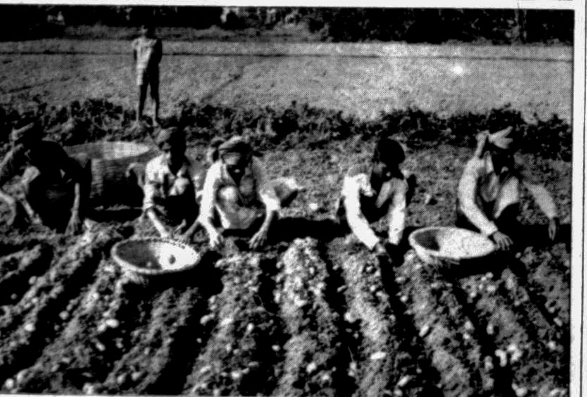
Farmers harvesting potato at a village in Munshigonj district.

A bag of cement is being sold between Taka 250 and Taka 260 in the local markets. Dealers have attributed the price hike to short supply of construction materials.