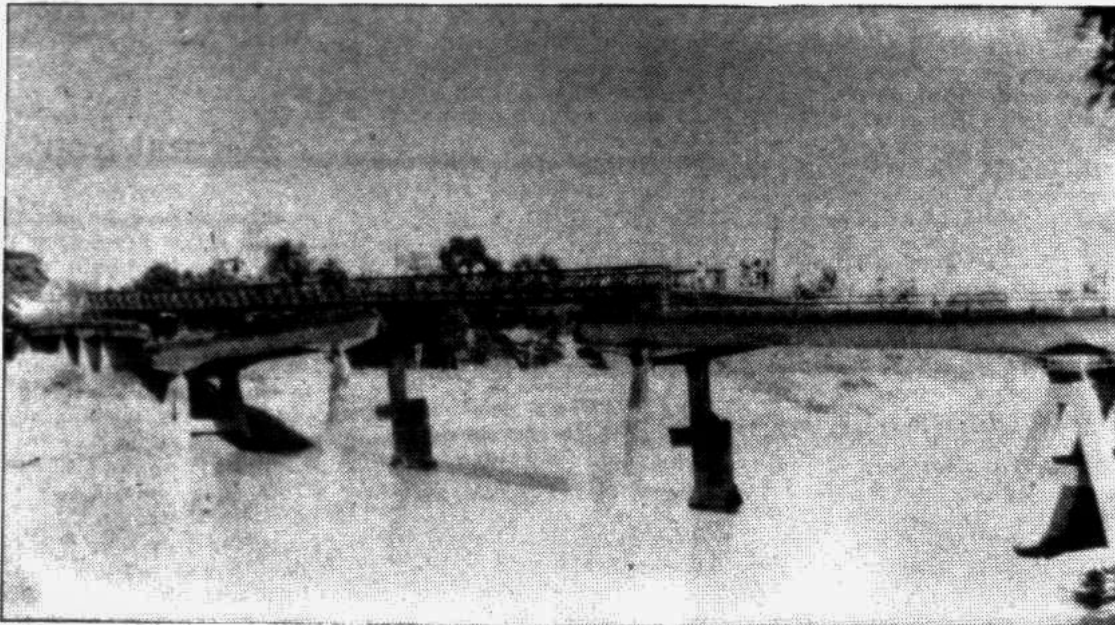
MAULVI BAZAR: Chadnighat Bridge over the Monu river on Kulaura Juri Road damaged during the Liberation War in 1971.

MAULVI BAZAR, Feb 16: The Chadnighat Bridge over the river Monu which was damaged during the War of Liberation still awaits reconstruction.