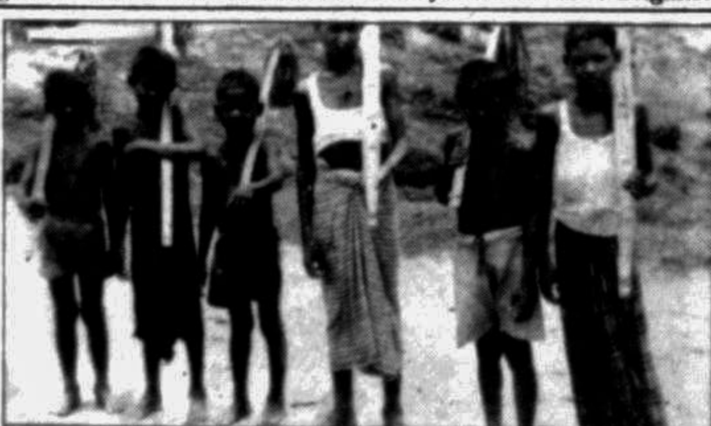
KURIGRAM: Child labourers from far-flung areas gather at Dharla ghat every morning in search of job. These youngsters are waiting with spades on their shoulders in the hope of getting a day's work.

The nation would again be in the grip of corruption, if that party was voted to power, the Shibir chief said. He said Chhatra Shibir and Jamaat-e-Islami wants to establish a welfare state in the line with Quran and Sunnah with the verdict of the people.