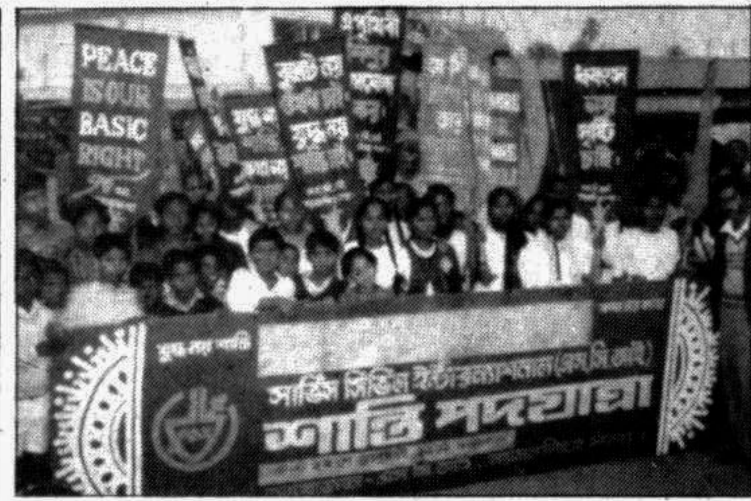
MYMENSINGH: An anti war procession brought out by Service Civil International in the town recently.

COX'S BAZAR, February 10: Frequent violation of traffic rules is making bus journey hazardous to and from the district headquarters, the most important tourist centre in the country. Journey by buses and minibuses is seemed too risky as those are overloaded and driven recklessly. Dilapidated roads of Teknaf-Chittagong and Cox's Bazar-Teknaf routes often cause road mishaps. Besides, whimsical driving of the transports on the routes also adds to the passengers' sufferings. Reports by the passengers said, sometimes goats, fishes, fruits and vegetables are