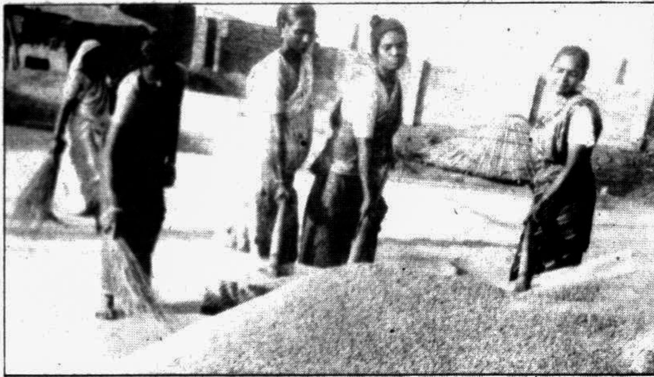
PABNA: Cheap labour force employed in husking mills.

February 10: Modhukhali Sugar Mills authorities have taken up a scheme to cultivate sugarcane on 15,000 acres of land in Magura, Faridpur, Rajshahi and Gopalganj zone during the current season, reports UNB. According to official sources, with the implementation of the scheme, about 13,612 metric tons of sugar worth over Taka 49.83 crore are expected to be produced.