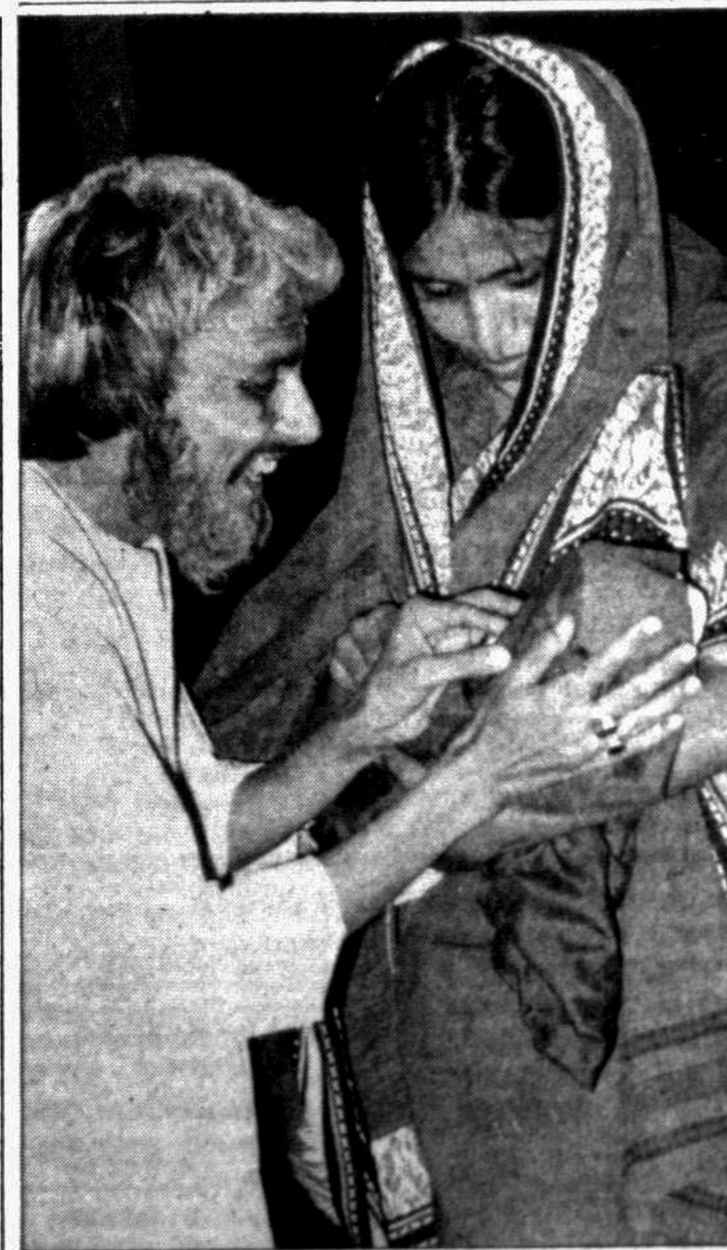
Samaj Sanskritik Gosthi staged play 'Ekti Nabajatak Shishu Abong Kintu' (One New-born baby and but...) at the Central Shaheed Minar premises on Thursday. With it, the drama week, in commemoration of the 1952 Language Movement, concluded.