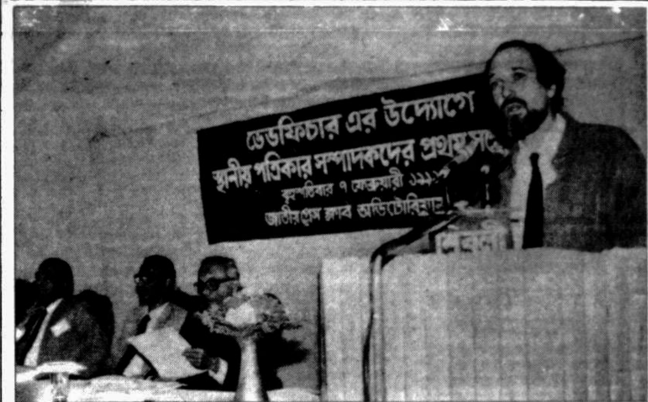
UNICEF Representative in Bangladesh Cole P. Dodge addressing the first conference of editors of regional newspapers at the National Press Club auditorium on Thursday. The conference was organised by DEV features, a non-governmental organisation.