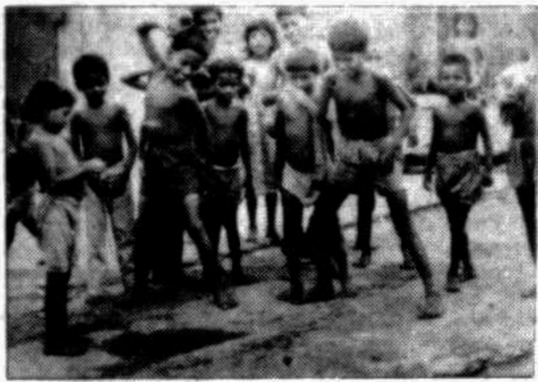
A brief partime on the street where they belong.

It is up to the social workers and civil authorities to come to the rescue of the misguided and unaided young ones and to firmly dissuade the youngsters from sliding into perverse habits and questionable ways of earning a living. Punishment preceded by a just review of their faults should do away with the tantalising lure of outright stealing, cheating or begging.