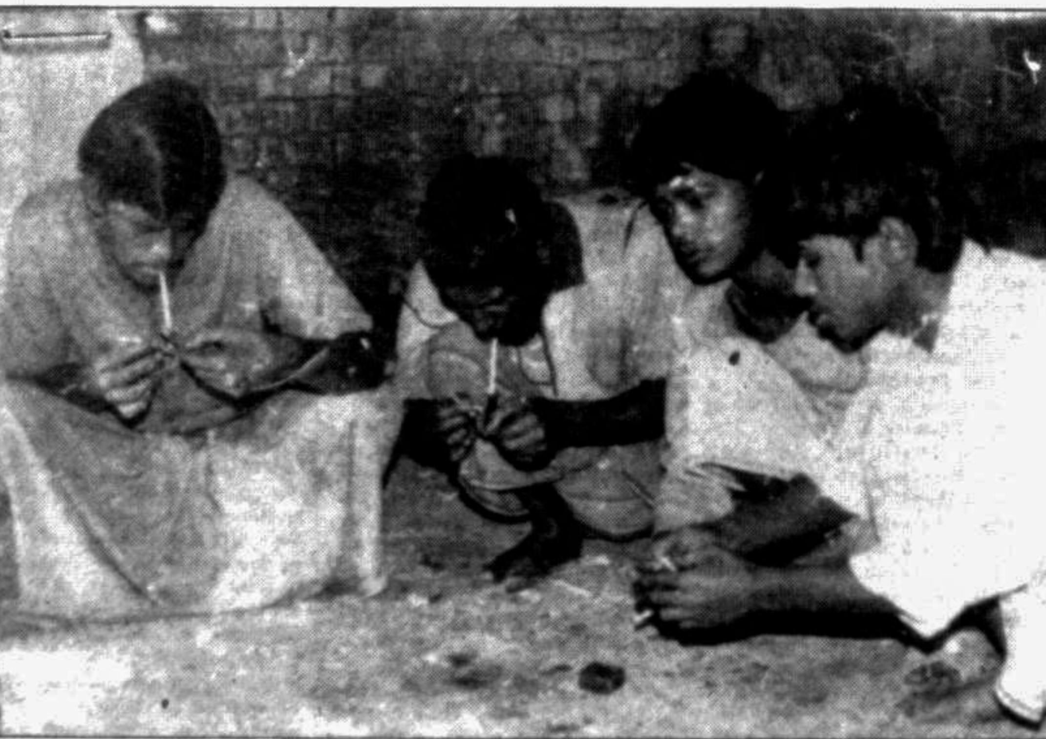
PABNA: Addicts taking heroin in broad daylight.

The people have called upon the concerned authorities to take stringent measures against drug traffickers.