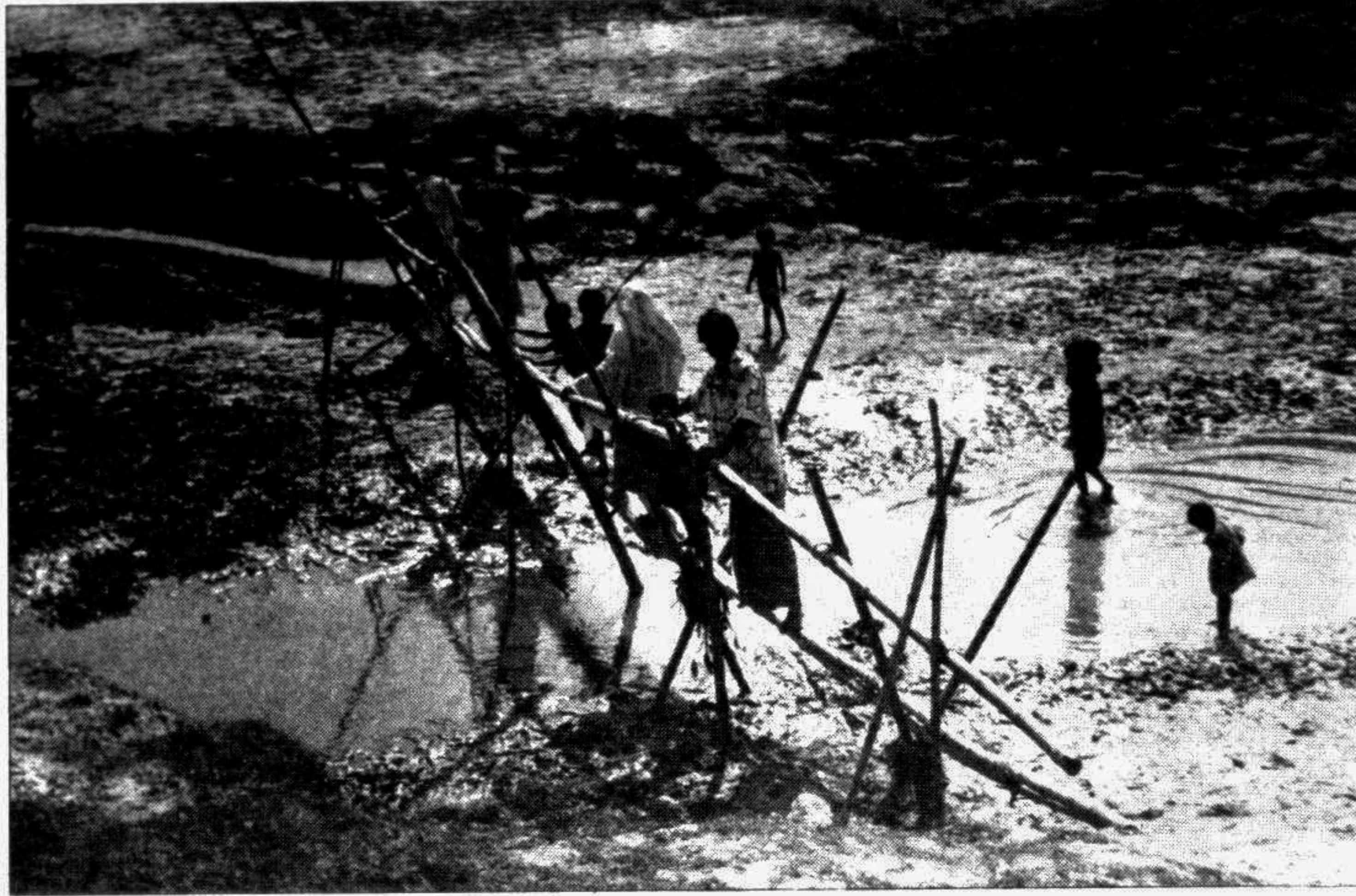
TONGIBARI: A portion of Arial-Kalma road at village Niti Roy, the only road connecting three upazilas of Munshiganj district is yet to be developed. Here villagers crossing a bamboo bridge to their utter difficulties.

Witnesses said fire originating from oven destroyed properties worth about Taka 25,000 at the house of Jonab Ali Shah in Goadanga village under Khashma upazila.