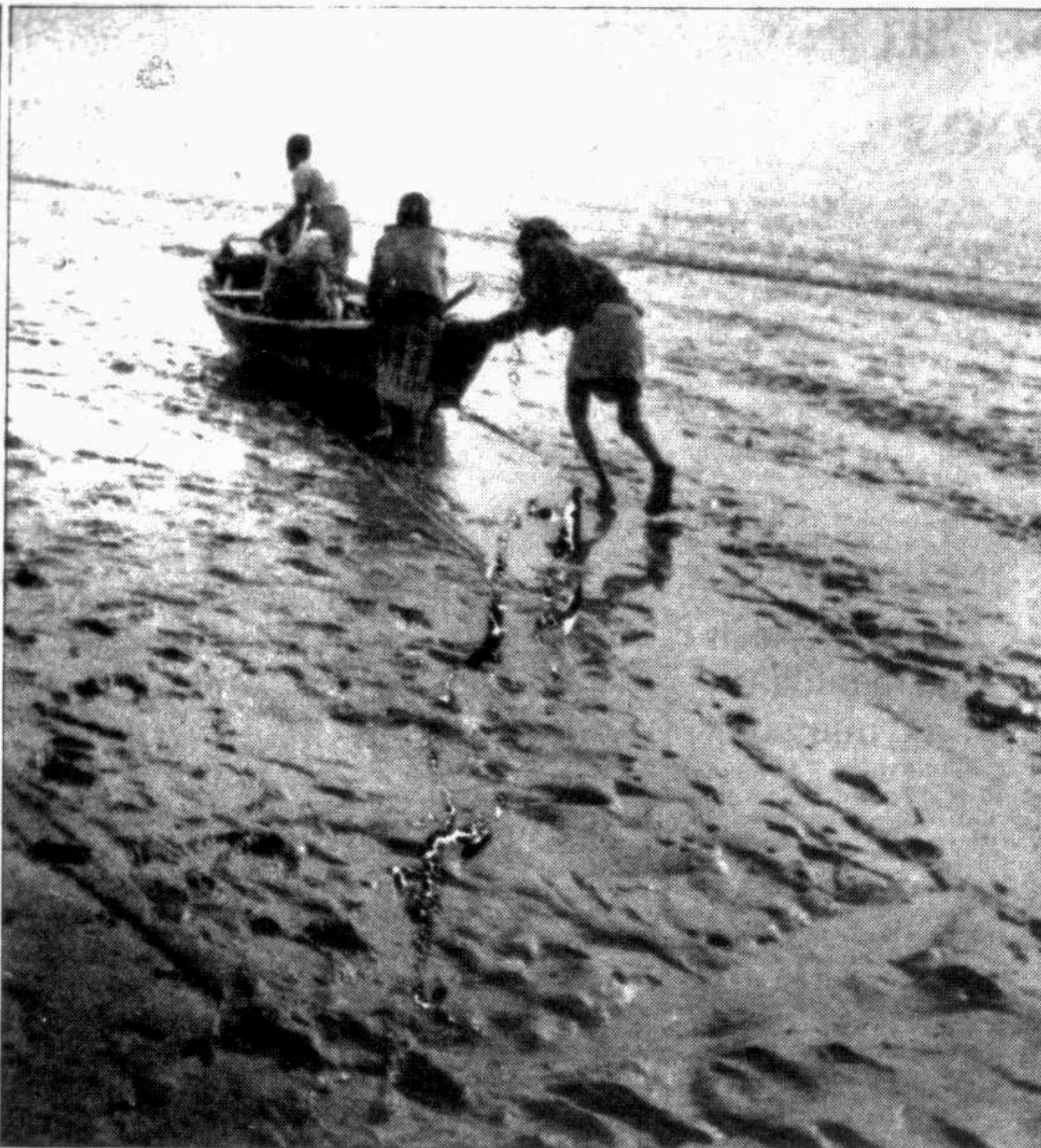
BARISAL: Siltation in the Meghna near Hizla Upazila threatens smooth ply of riverine transport.

February 4: Madrasha students brought out a procession here in the town, staged demonstration and submitted a memorandum to the Deputy Registrar of Islamic University recently to press home their demands, reports UNB. The demands include increasing the number of seats of madrasha students in the Islamic University, to stop conspiracy to destroy madrasha education and introduction of a number of subjects like Ulumul Hadis, Ulumul Fekah, Ulumul Din, Ulumul Sharih, Usuluddin, Ulumul Akhaid and Islamic Banking course in the university syllabus.