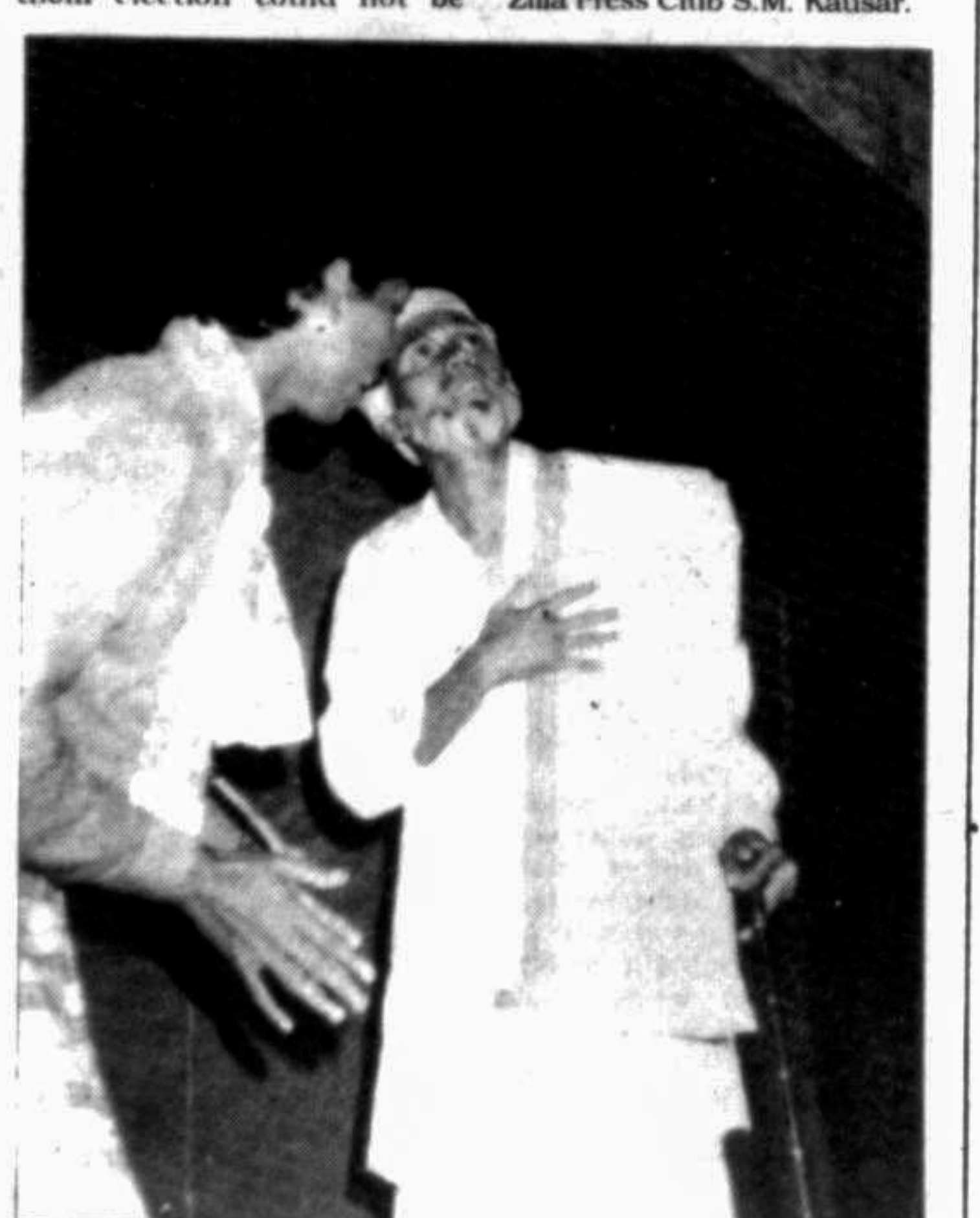
COMILLA: A scene from the drama 'Lash Gari' staged by Satarupa, a cultural organisation at Comilla Town Hall recently.

Twenty persons were injured seriously in a clash between two rival groups of the village Sada Mahal in Ranagan Union Parishad no 6 under Bochaganj upazila recently. According to the report, some children were playing football in the field of a local primary school. Suddenly, the ball hit one Azam Mahmood of the same village. As a result, a quarrel picked up and the villagers were divided into two groups and attacked each other with lethal weapons. Twenty villagers of both group were injured seriously in the clash. Six of them were admitted to the local hospital. Cases have been registered with Bochaganj police.