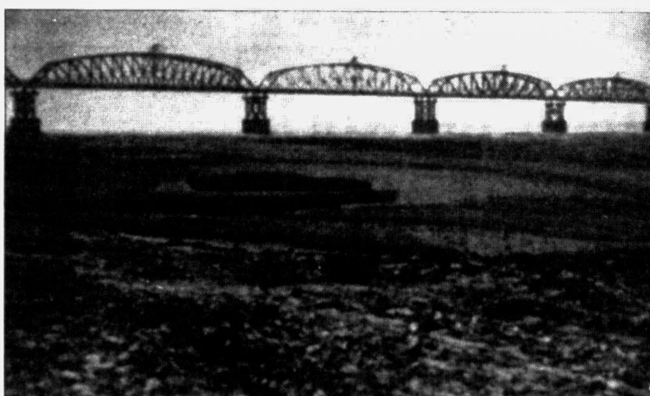
PABNA: A big char in the Padma has developed at the Hardinge Bridge point. This is a result of withdrawal of the Ganges water at Farakka.